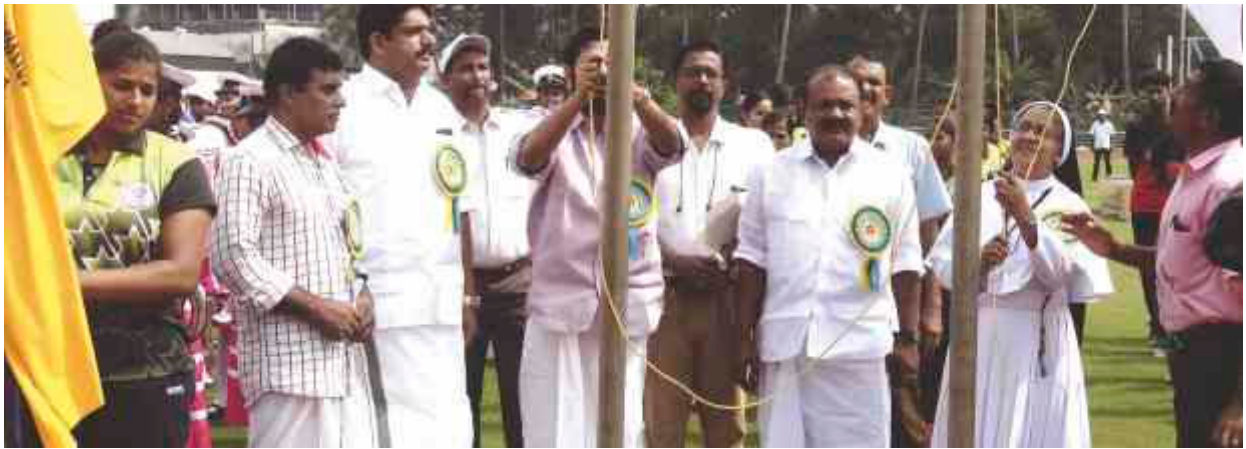
Inauguration - MG University Athletics Championship 2018 - 19