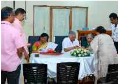
Interaction with the Office Staff