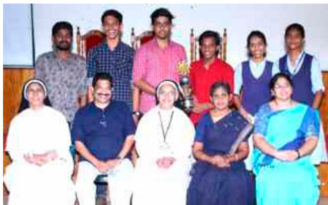
Intercollegiate Quiz Competition 2019

The Department of Mathematics had a remarkable academic year in 2018-19 excelling both in academic and extra-curricular activities. On the academic front, the Department continued its tradition of securing excellent results in the B.Sc. degree