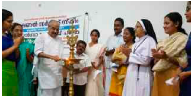
Inauguration of Seven Day Special Camp

The special camp was held at the flood affected ward 5, Mutholy on the theme "Green Village, Clean Village". The camp was inaugurated by Sri KM Mani MLA . Classes on "Waste Disposal and