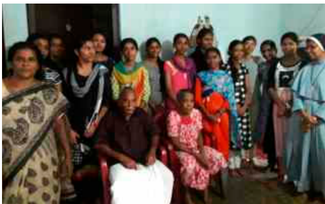
House Visit by CSM members

CSM members visited the houses of teconomically backward families nearby our College. CSM conducted Christmas celebration of our College with a beautiful play of nativity. Many CSM members actively participated in the UBA household survey conducted by the college.