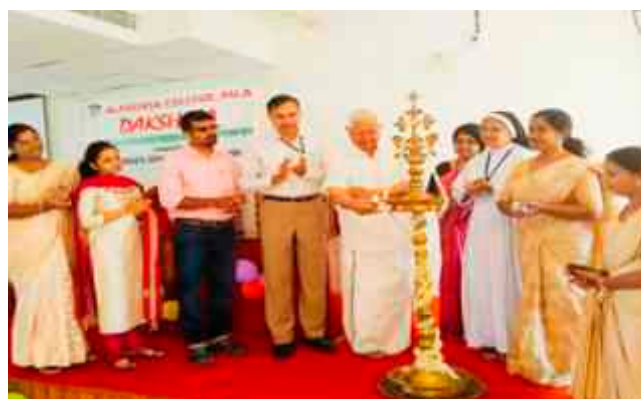
Inter Collegiate Paper Presentation Competition DAKSHATA 2K18

Kuttikkanam and St Berchmans College Changanassery, followed by his Lecture on the topic “T S Eliot’s Poems, Novels and Critical essays”. As part of the World Environment Day (WET), the Department organised a Poetry and Collage competition on 7 th June 2018 at the Seminar Hall. Further, the Department