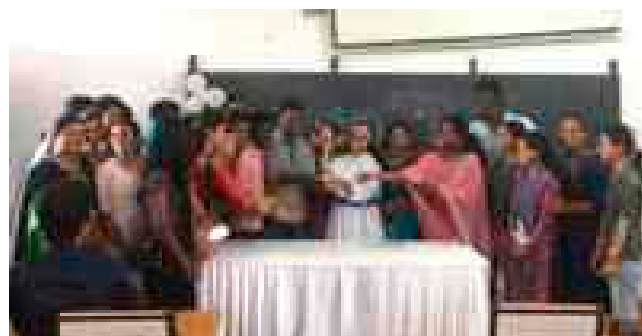
Vanya - Intercollegiate Zoo Fest