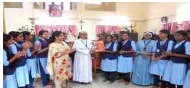
Release of manuscript magazine - 'Kalika'

orphans of National Dalit Federation Charitable Society and St. Pious orphanage Pala during the Reading Week. The Malayalam Department along with the Dept. of Hindi hosted a National