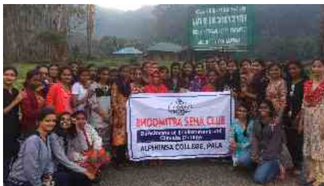
Three day nature camp at Pampadumchola National Park