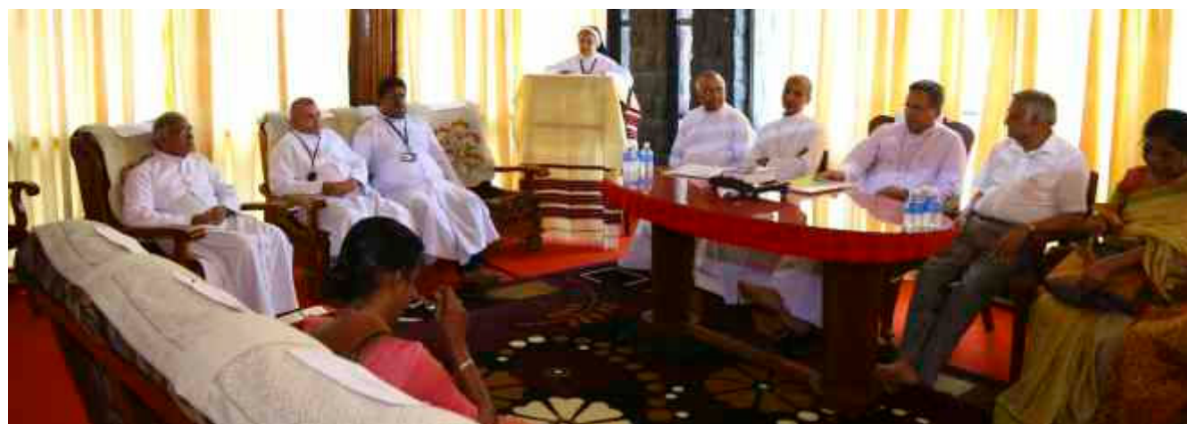
Discussion with the Management Board