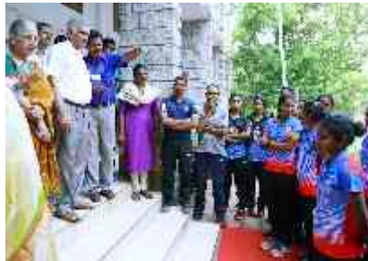
Interaction with the Sports Students