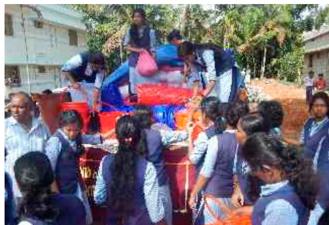
Flood Relief activities at Thiruvarpur Panchayat

umbrellas and donated them to the inmates of Snehabhavan, a care home for orphaned girls in Melukavumattom. As part of the Centre's mission of promoting a sense of social commitment among the students as well as contributing to the development of the society, this year also members of the Gandhi Forum visited the sub jail at Pala on 29 January 2019 and donated 85 books to the jail library and conducted several indoor games for the inmates. Copies of Mahatma Gandhi's autobiography and booklets on RTI Act, green living, the hazards of plastic and waste management published by the Centre were also distributed to all the inmates and officials of the jail.