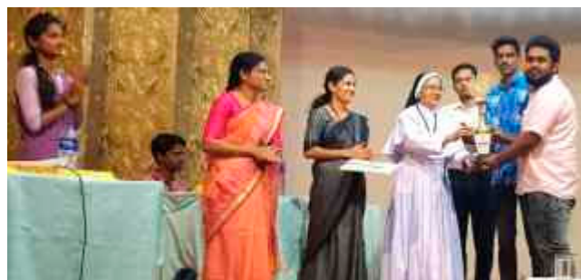
Bishop Vayalil Memorial All Kerala Intercollegiate Quiz Competition

Alphonsa College has an active Quiz Club. The club meets twice a month. The Bishop Vayalil Memorial All Kerala Intercollegiate Quiz