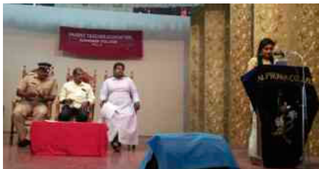
PTA General Body Meeting

Alphonsa College Pala has an active PTA that participates dynamically in the smooth functioning of the college. The first executive meeting of the PTA was held during the month of June. Three executive meetings were conducted during this academic year.