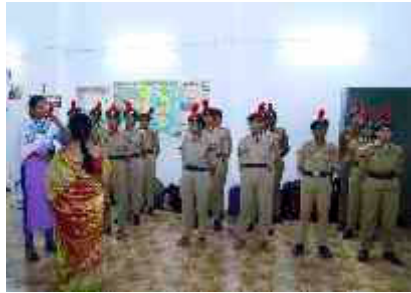
With the NCC Cadets