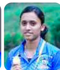
SIMI N.S. ATHLETICS