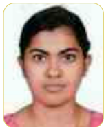
Indu B S English