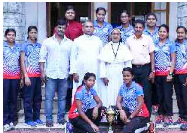
M.G. University Winners Weight Lifting And Power Lifting Team