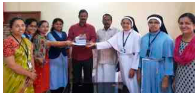
Distribution of books and stationeries to St. Pious Orphanage Pala

Malayalam in collaboration with Kerala State Chalachithra Academy organized a three-day National Seminar on "Film and Literature" from 18th to 20th July 2018. Hindi Department in association with NSS unit of our college collected books and