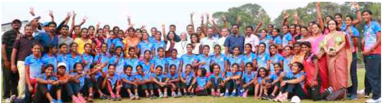
MG University Athletic Champions 2018-19