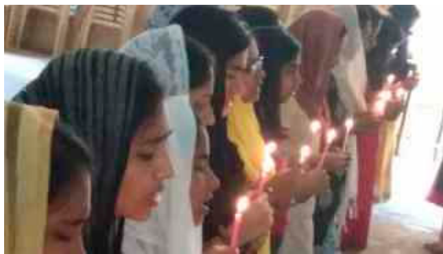
Thanks Giving Day