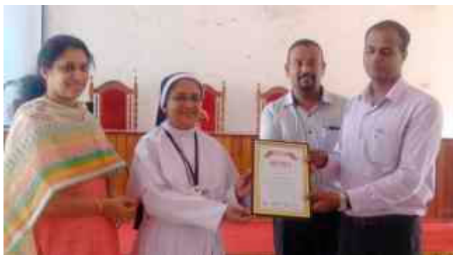
Alphonsa College recognised as partner institute by British Council IELTS

The cell conducted various programmes for the students in order to familiarize them with the possible areas in higher education,