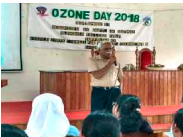
Ozone Day Celebration

Asst. Professor, Dept of Botany, Government College, Nattakam, Kottayam served as the resource person. The Department organized a one day programme in connection with the World Ozone Day on 17 September 2018 supported by the Kerala State