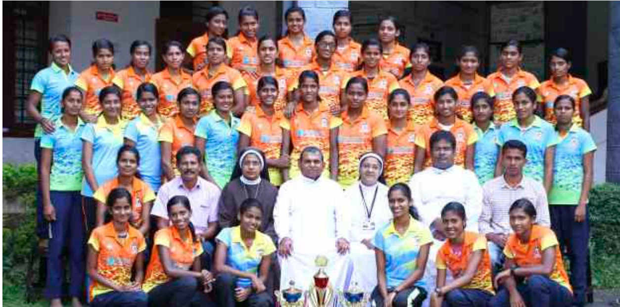
Kerala State Inter Club Athletics Championship Winners 2019