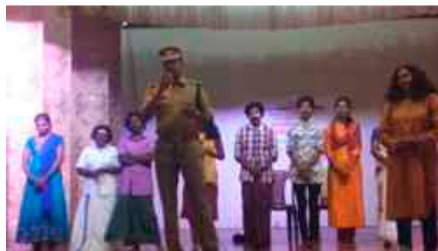
Awareness Programme against "Alcoholism, Drug Abuse and Atrocities Against Women"