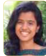
Alphamol Physics Model I