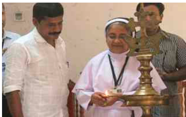
Inauguration of the Women Entrepreneurship Motivational Club