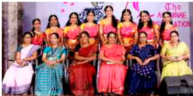
Winners of Dance Competition 'NATYA' organised by the Alumnae Association for the students of the college