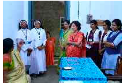
With the NSS Volunteers