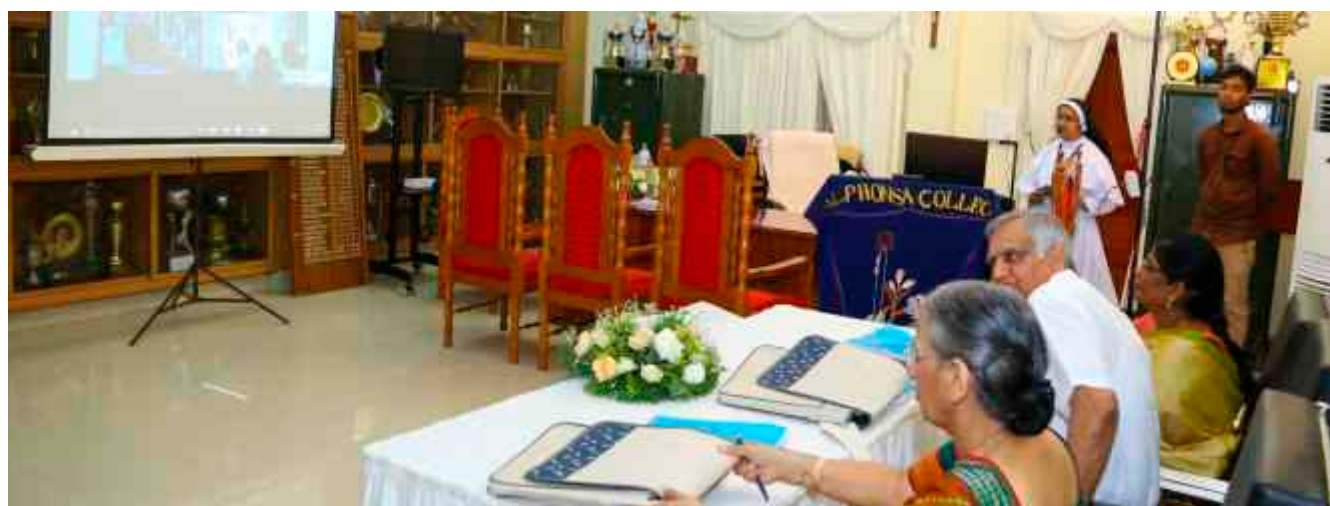
Interaction with the Management