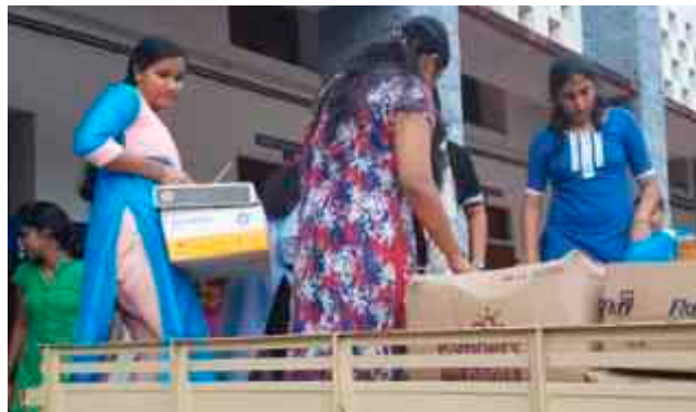
Material Collection for the flood-affected people in Kuttanad and Kumarakom