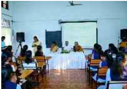
Interaction with the Students