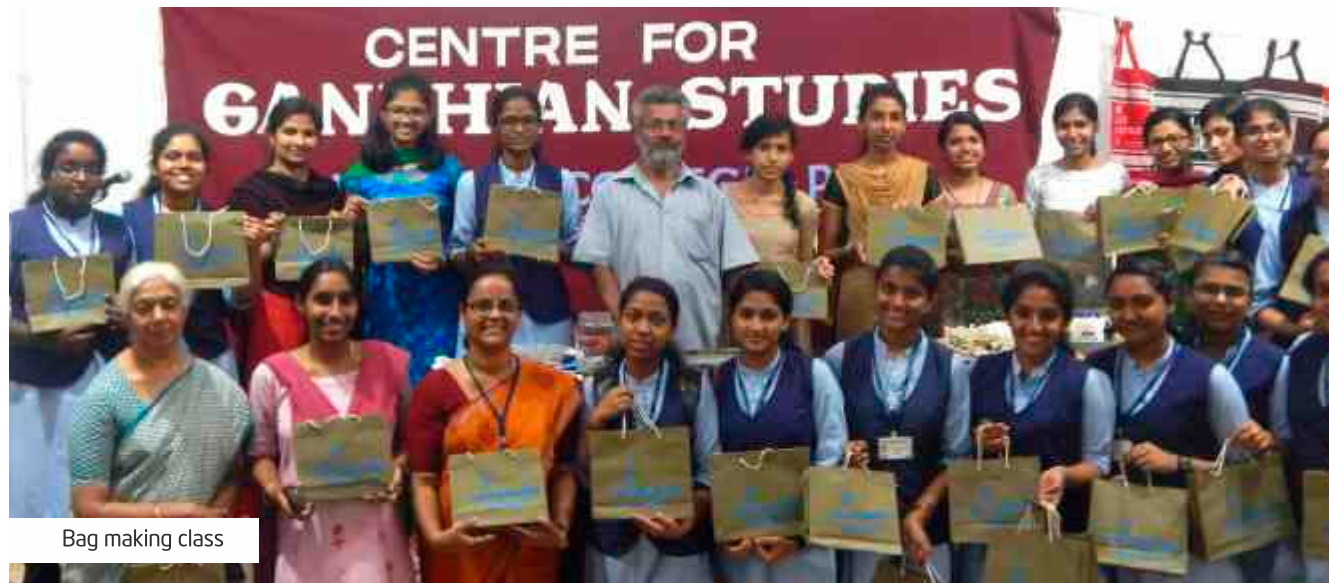
Bag making class

At the beginning of the academic year, members of the Gandhi Forum collected note books, stationery items, school bags and