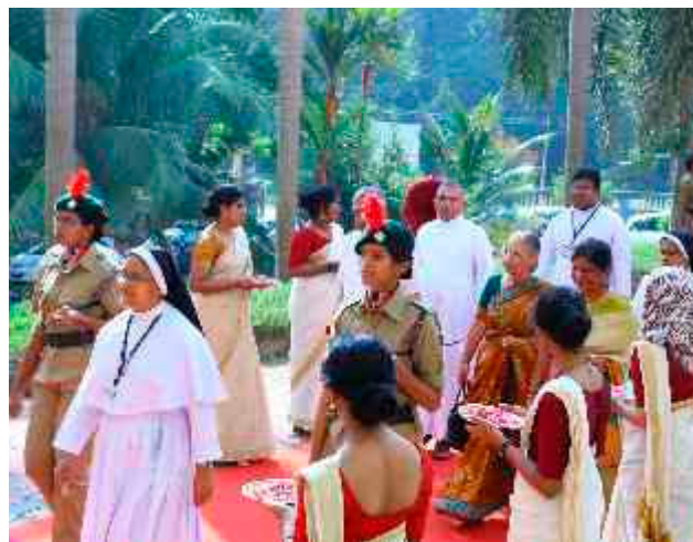
Reception to the Peer Team Members

The college is grateful to all NAAC Officials including the Peer Team members, NAAC member Coordinator, and other NAAC administrative and technical staff for their constant and instant support during the SSR preparation and submission. The college will certainly sustain its quality in all the curricular and co-curricular activities. As it is said: Good, Better, Best; let us not rest, until good transforms into the best.