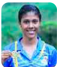
RIZANA P.A ATHLETICS