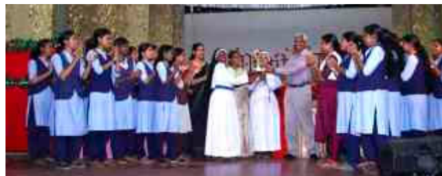
Arts Festival II Runner up - Department of Chemistry & Mathematics

and Head of the Research and PG Department of Chemistry, K. E College Mannanam. The Association organized a congratulatory function for the rank holders and A+ holders in the B. Sc Degree