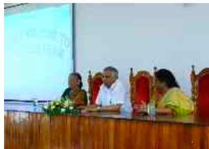
Interaction with Alumni & PTA