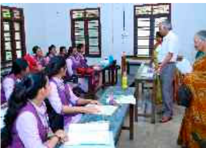
In Class Room