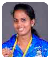
SHANI M.S. VOLLEYBALL