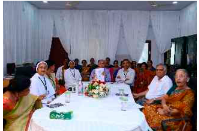
Discussion with the IQAC