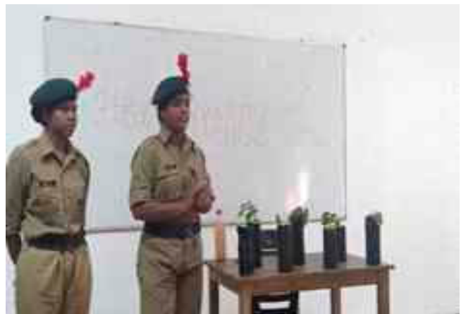
Demonstration on Hydroponics