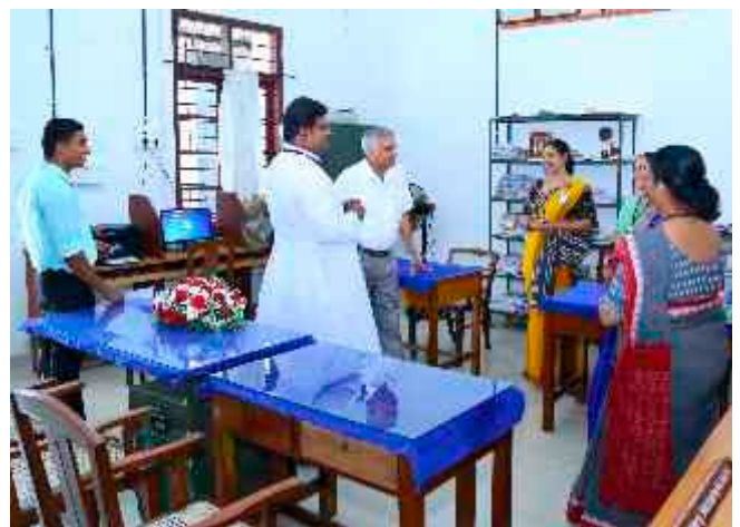
Visit to the Departments