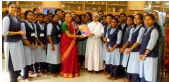
Releasing Hindi Manuscript Magazine 'Gulzar'

During the academic year 2018-19, the Department of Hindi conducted various activities to encourage and develop the skills of students in Hindi literature. The Departments of Hindi and