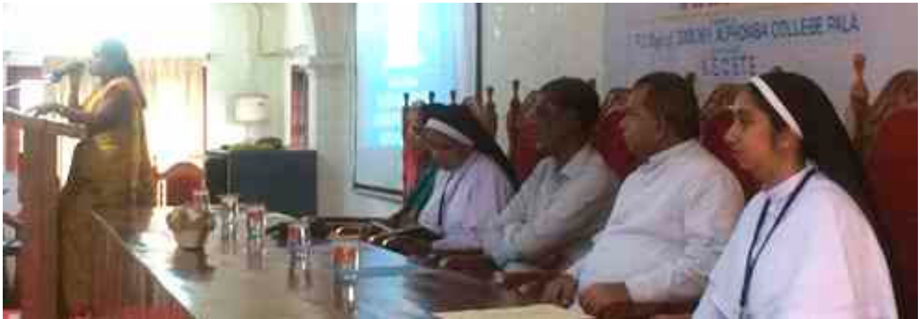
Inaugural Session of ECOZEPHYR 2018