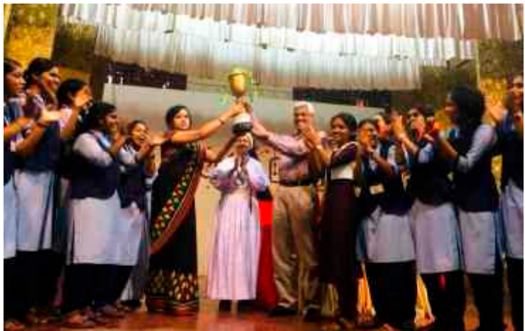
English Association- Overall Champions in Arts 2018-19