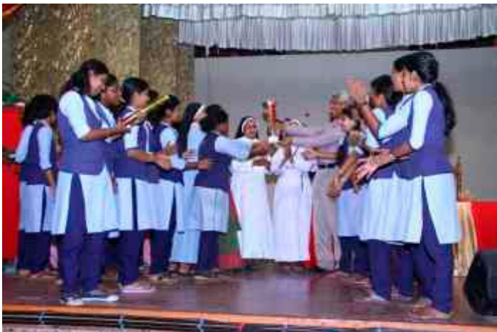
Economics Association- Overall Champions in Sports 2018-19