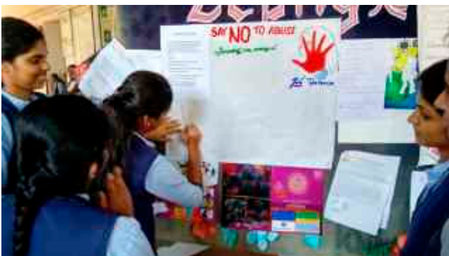
Say No to Abuse-Observing Women Safety Week on the campus