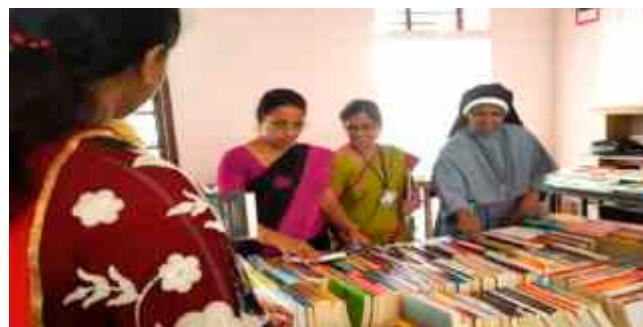
Book Exhibition cum Sale

The events of the Dept. of Malayalam commenced with the Essay writing competitions held on Environment day and Reading week. The Department collected books and stationeries for the