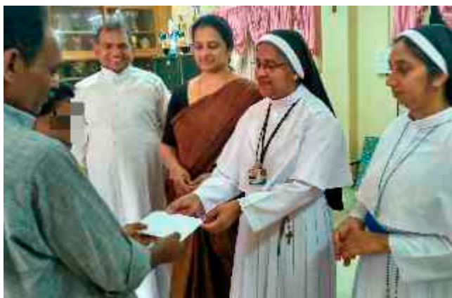
House Building Assistance was provided to one of our students

Youth Red Cross is active in Alphonsa college. During the academic year 2018-19 two students from each class were