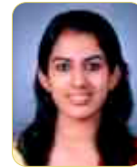
Nimmy Sunny Physics Model I