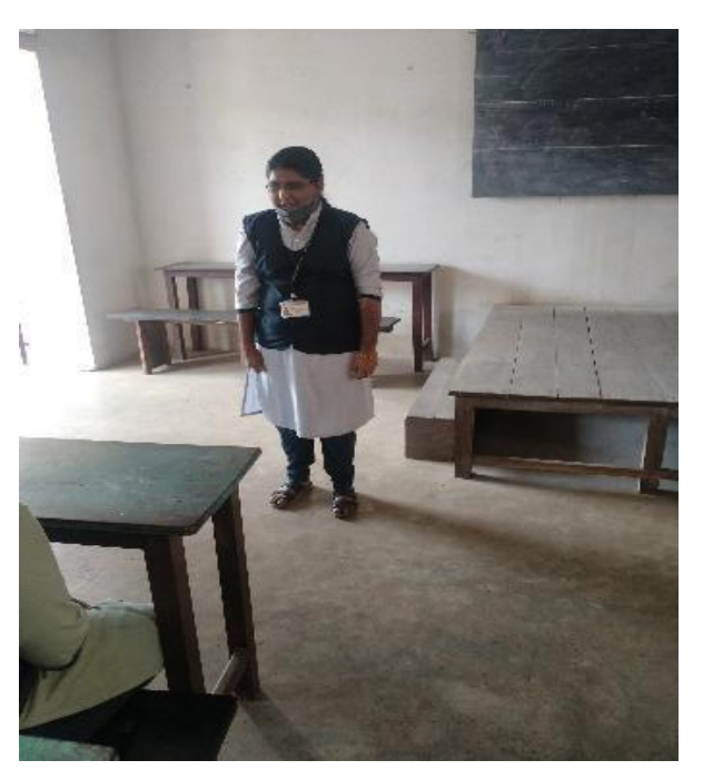
Solo music performance competitions for the PWD students.