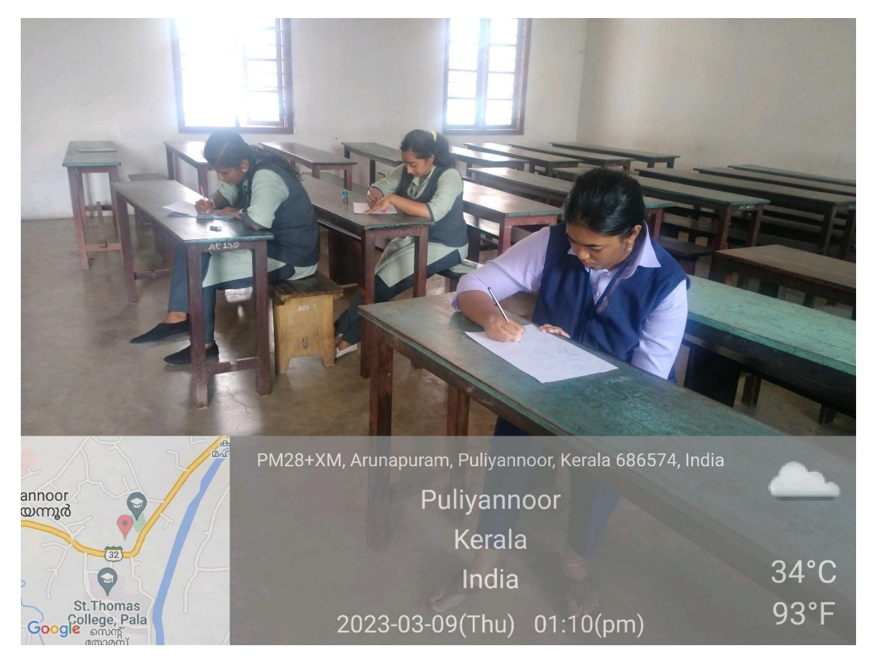
Pencil Drawing Competions