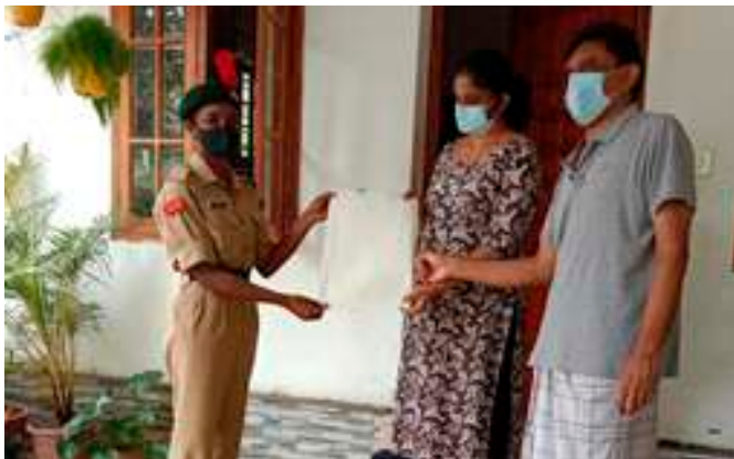
Distribution of cloth bags to households