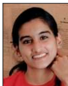
Alja Gifty T A Plus CCPA 9.38