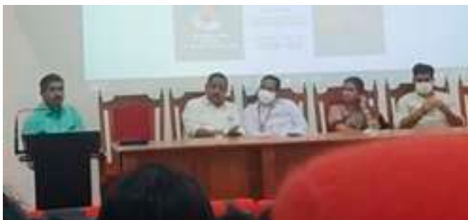
One day workshop on 'Methods and Techniques of Designing Projects in History' organized by History Department in association with SREE at St Thomas College, Palai .