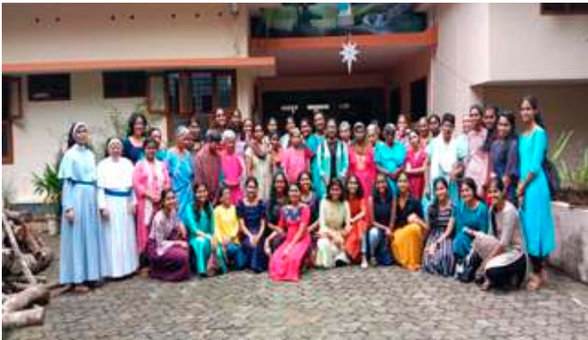
Visit to Ave Maria, Mental Rehabilitation Centre at Aruvithura

blood donation camp as part of NCC day celebrations. Audio books were released to aid the needs of Visually challenged. As part of Azadi ka Amrit Mahotsav the cadets of the sub unit distributed National Flag to 50 households in and around Pala. The sub unit also organised an Anti Plastic campaign and distributed cloth bags to nearby households. The sub unit also organised an anti drug campaign to spread an awareness among the public on the health hazards drug abuse can lead to. The Charity Cell of Alphonsa College NCC unit has been contributing to the financial needs of the less privileged to meet their medical expenses.