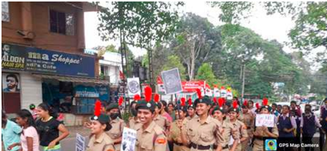
Anti drug Campaign