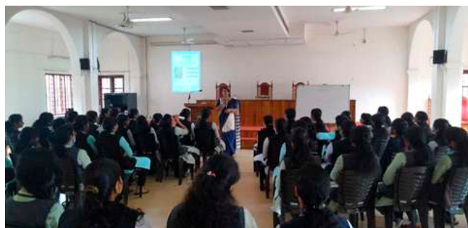
Workshop on Personality Development