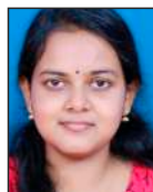
Panchami B A Plus CCPA 9.08