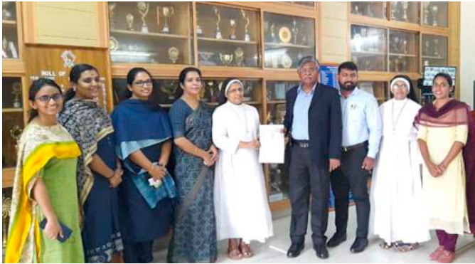
Memorandum Of Understanding With The International Institute Of Migration, Trivandrum