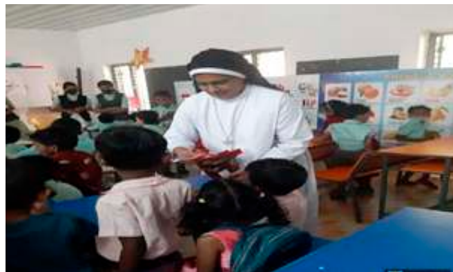
A painting competition and 'plant a tree' campaign in Govt.New LPS,Puliyanoor