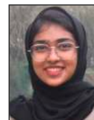
Henna Rank 3 CCPA 9.29