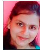
Cinfy K A Plus CCPA 9.05