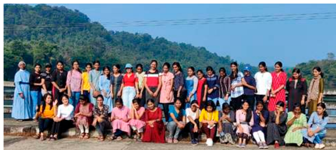
Three days Nature Study Camp to Thattakkad Bird Sanctuary