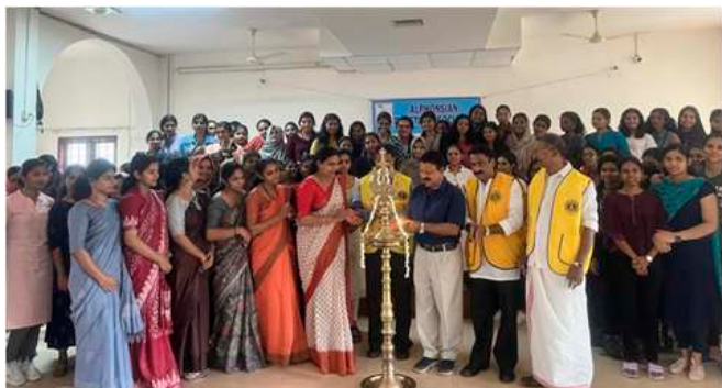
Inauguration of nutrition awareness program in association with Lions Club, Aruvithura

On October 6, 2022 an interdepartment poster competition was organized to create an awareness about the harmful effects of drugs and its abuse. Kerala piravi was celebrated on November 1 and conducted malayali manga contest. On November 9 Flameless recipe competition was organized as part of the observance of world food day. On November 15, a flash mob was organized by I MSc students as part of the observance of world diabetes day. Nutrition awareness program was organized on November 28 in association with Lions Club, Aruvithura. B.Sc. students provided online nutrition education to housewives in Mutholi Grama Panchayat. They have developed low-cost nutritional recipes for different sections of society, including breastfeeding mothers, teenage girls, school children, and pregnant women. Teachers also conducted awareness classes in various schools in connection with national nutrition month.