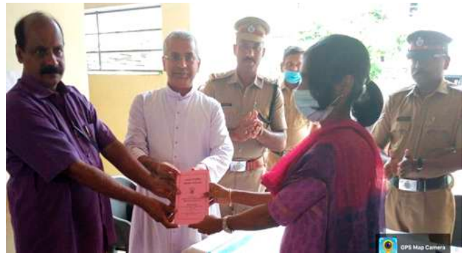
Distributing Booklet on the Problems of Alcoholism and Drug Abuse published by the Centre at Pala jail.