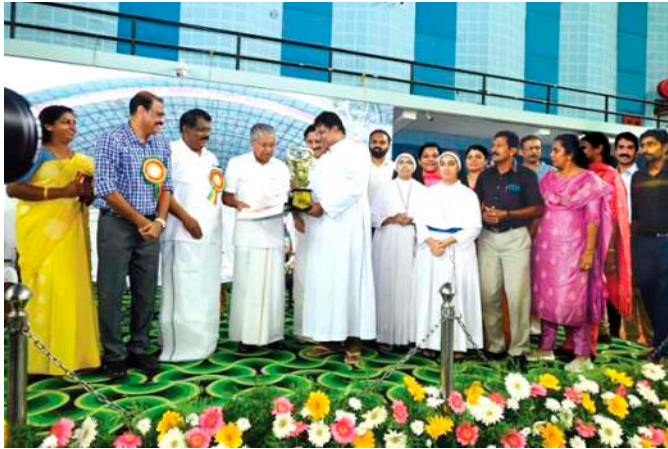
Receiving G.V Raja Award

Athletes represented Kerala in the National Inter Club Athletic Meet held at Andhra Pradesh. More over our 6 Athletes represented Kerala in the National Cross Country Women Championship held at Guwati.