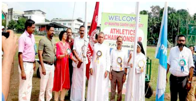
40th M.G University Intercollegiate Athletic Championship 2022-23 flag hosting ceremony