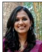
Malu V A Plus CCPA 8.98