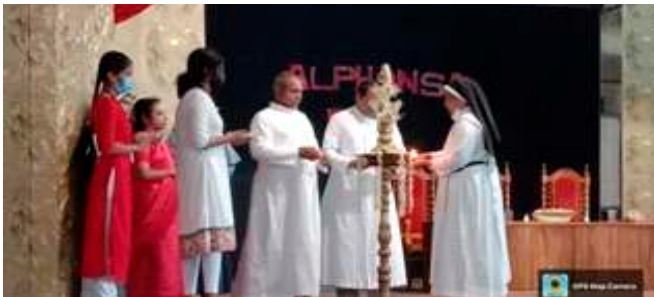
Inauguration of CSM

organised various competitions like Carol song Competition, Star making Competition etc. The students enthusiastically participated in the event. Next day, they held a dancing Santa contest in which Santas from different departments participated in the contest. Live crib competition was also conducted, where creative models of Live crib were exposed. CSM along with Jesus Youth helped in coordinating the programmes. CSM of Alphonsa College successfully conducted an Inter collegiate recitation and versification contest on 8th February. CSM students of our college attended Inter eparchial camp 'YUVI' at Adilabad from 17 April 2023 to 23 April 2023.