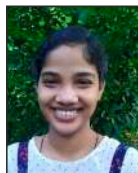
Rosemary S A Plus CCPA 9.22