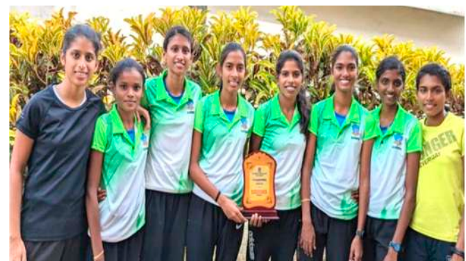
College Cross Country Team