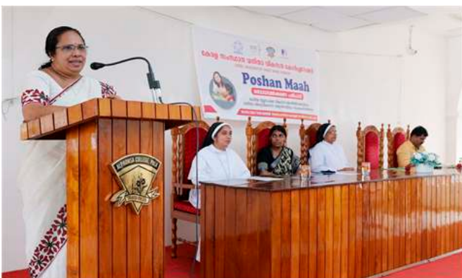
Inauguration of PoshanMaah – Awareness Campaign