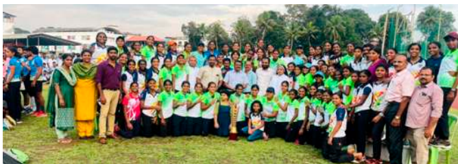
M.G University Inter collegiate Athletic Champion