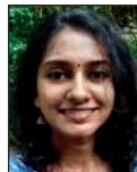
Bhadra G A Plus CCPA 8.58