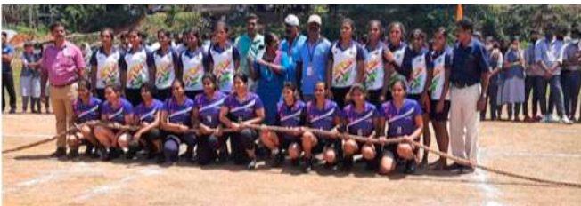
Tug of War Team