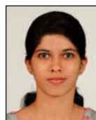
Dona Jose A Plus CCPA 8.74