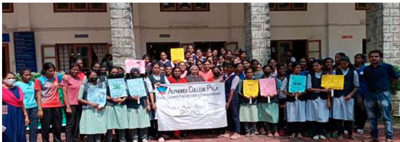
"Walkathon-walk away from drugs" as a part of Anti drug campaign