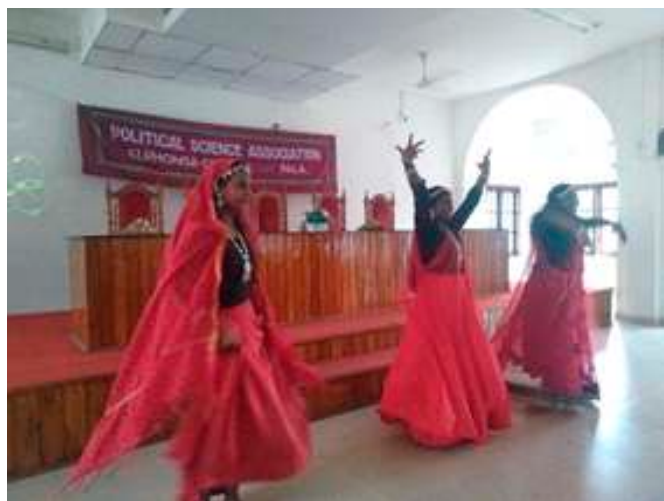
Statehood day of HP