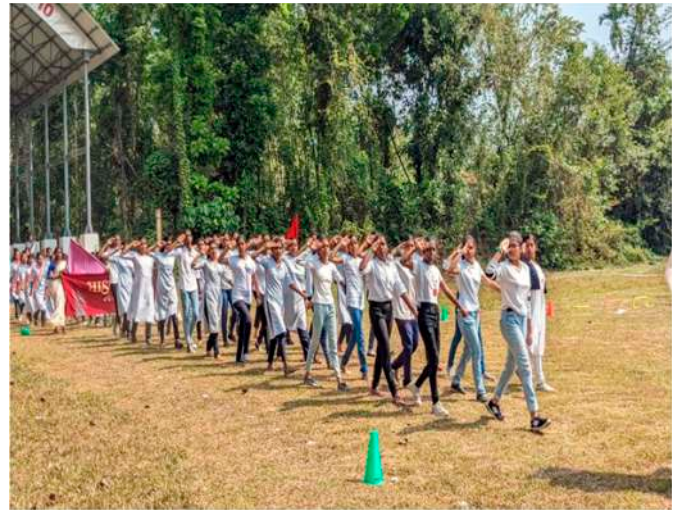
College Annual Sports Meet 2022-23