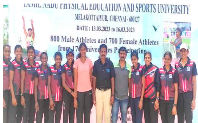
All India Inter University Athletics Championship at Chennai