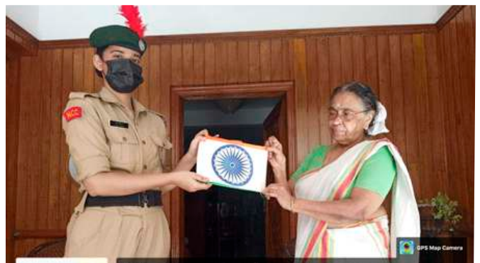
Har Ghar Chanda

The NCC Sub unit of Alphonsa College Pala has a strength of 108 cadets and an officer. 50 cadets attended various Annual Training Camps this year. Cadets also got selected for Special National Integration Camps, Ek Bharat Shresht Bharat Camps, Army Attachment, Tal Sainik and Republic day preparatory camps. Being a group of socially committed youth the sub unit initiates various social service activities. The sub unit organized