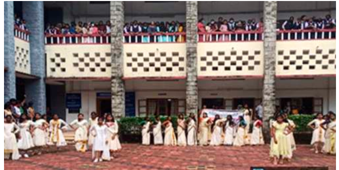
Fashion Show of Traditional attire on Kerala Piravi Day