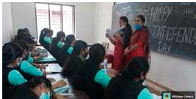
Essay Writing Competition