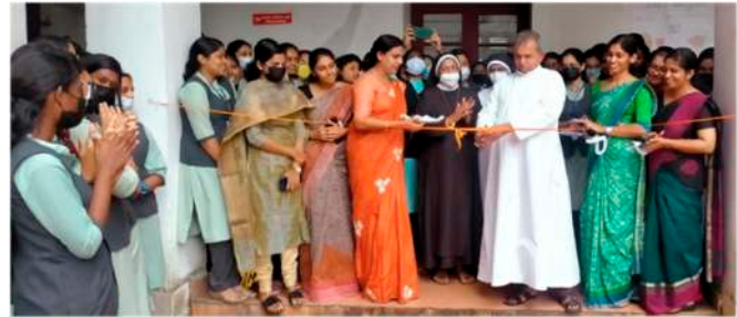
Inauguration of food fest