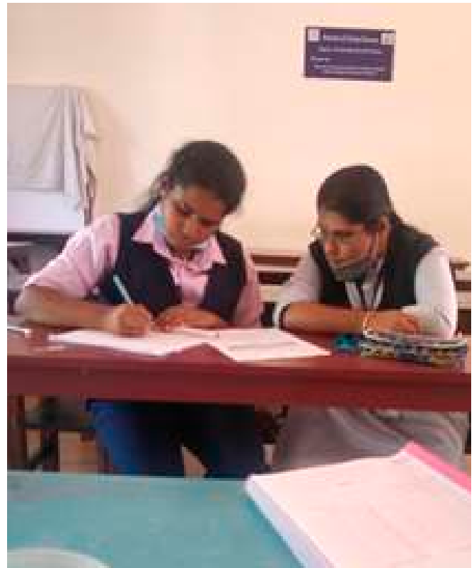
Scribe facilities for pwd students

opportunities, ensure barrier-free access to all buildings of Colleges, Departments, Libraries, Hostels and offices, provide counseling for psychological support and fulfill the needs of PWDs in all categories including Visual, Hearing, Orthopaedic, Neurological, etc. Scribe facilities have been arranged for pwd students. They are given opportunities to sing morning prayers in the college.