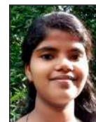
Essa Raincy A Plus CCPA 8.83