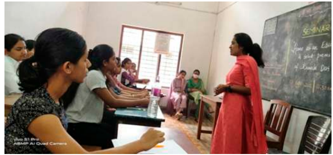
Seminar on Home as Escapism in Select Poems of Kamala Das.