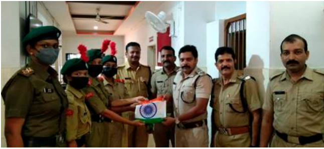
Azadi ka Amrit Mahotsav