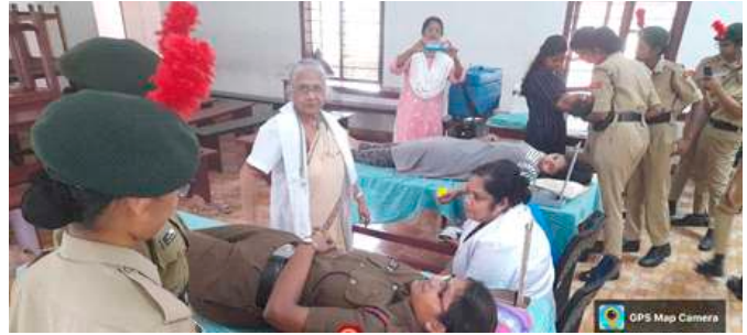
Blood donation camp