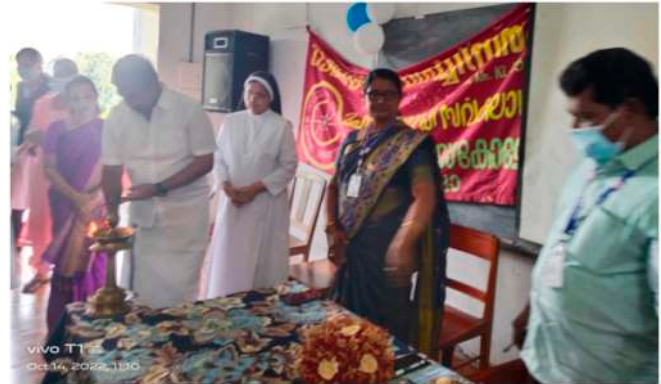
Inauguration of Electoral Literacy Club

students of the college participated. Electro literacy club organised a voter's enrolment drive in the college on 7th December 2022. National Voters Day was observed in the college by taking voters' pledge by the students, teaching and non teaching staff of the college on 26th January 2023. In connection with National Voters Day Poster designing competition was conducted on 24th January 2023.