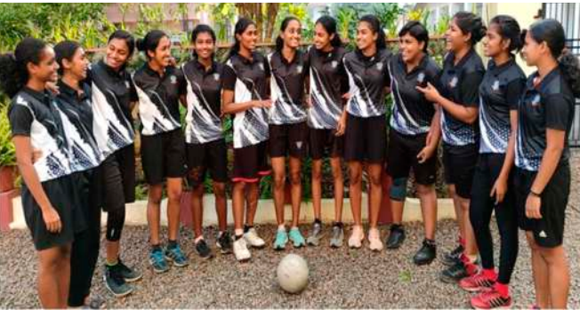
College Netball Team