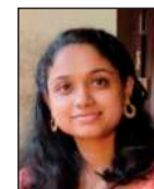
Vishnupriya K G A Plus CCPA 8.64