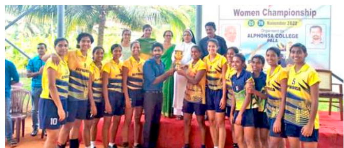
40th M.G.University Inter Collegiate Volley Ball Champions