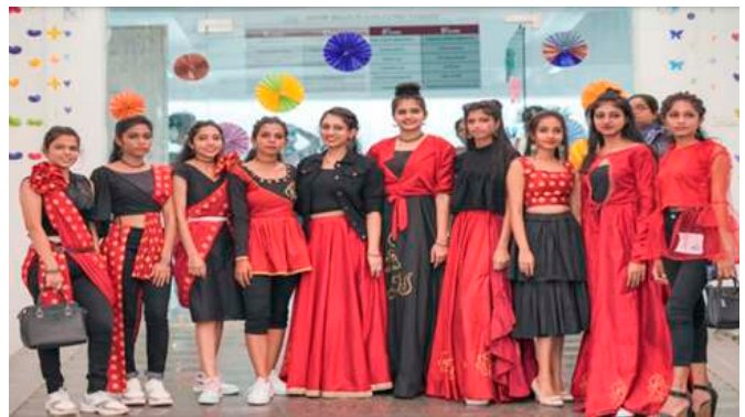
"Mangalam Fest" intercollegiate event conducted at Mangalam College of management studies, Ettumanoor