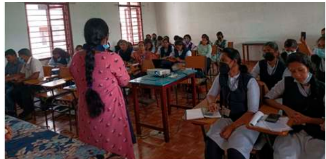
Class on Linking Adhar and Voters ID