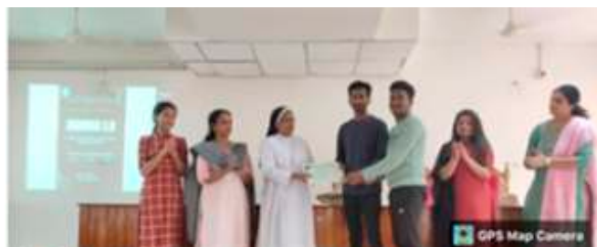
Brainiac, annual intercollegiate quiz competition for the undergraduate students