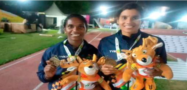
Khelo India-4x100Mtr Relay Gold