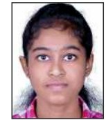
Sandra S A Plus CCPA 8.75