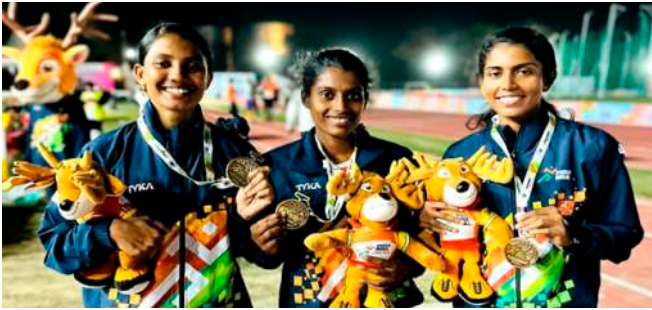
Khelo India-4x400Mtr Relay Gold