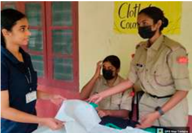
Cloth Bag Counter s part of Anti Plastic campaign