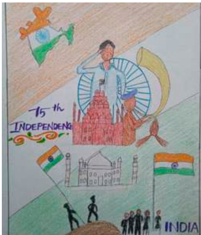
Poster- First prize