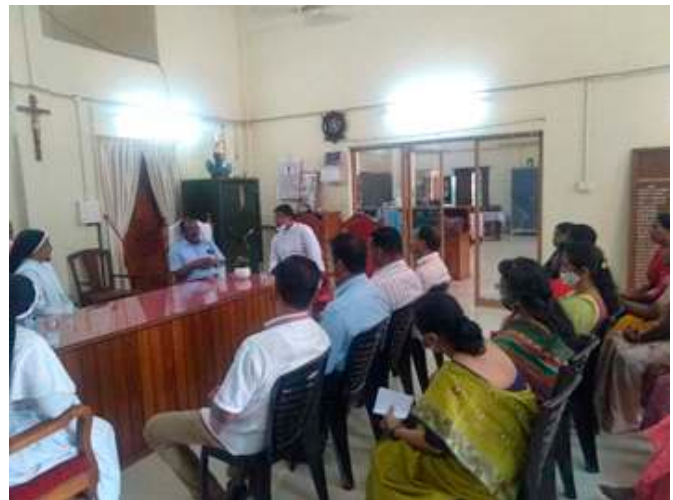
Administrative staff training program