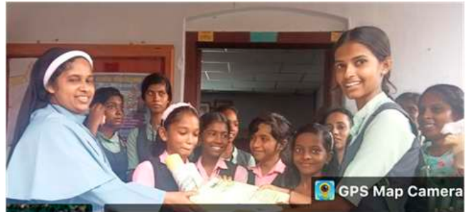
Donating educational materials for the 50 students of Kalanikethan primary school, Puliyanoor Pala