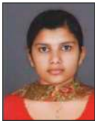
Aryamol T U A Plus CCPA 9.02