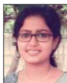
Athira B A Plus CCPA 8.61