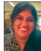
Carol Sunny A Plus CCPA 8.89