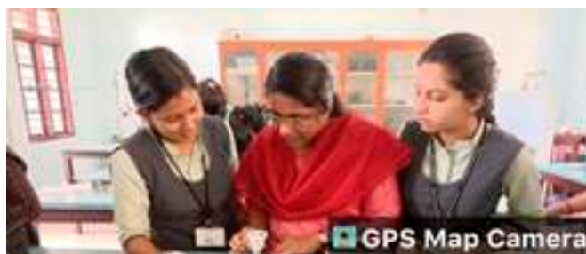
Workshop on repair of LED bulbs