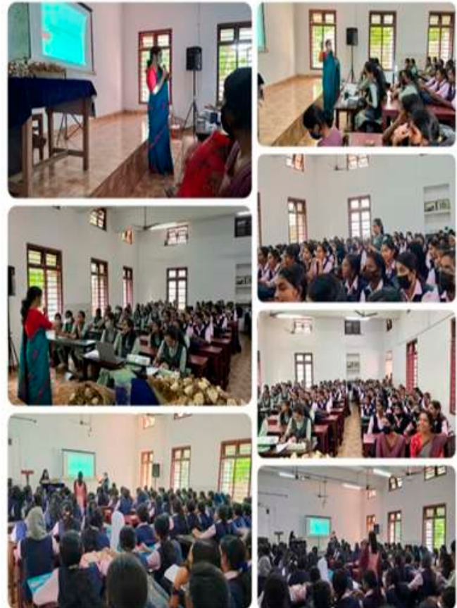
Women safety awareness class