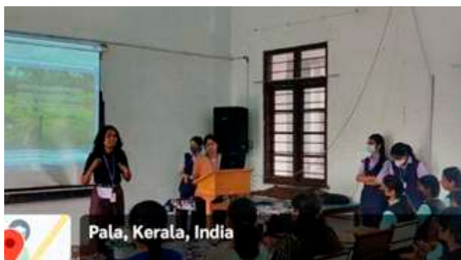
Participant presenting in the "Intercollegiate powerpoint competition" in connection with World wetland day organised by the Zoology Department.