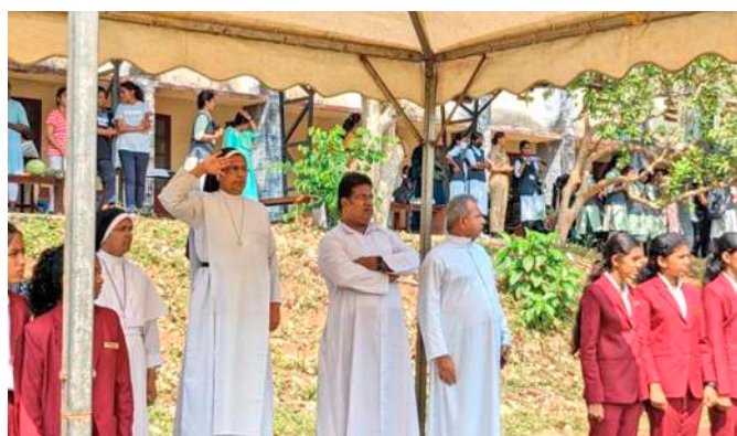
College Annual Sports Meet 2022-23