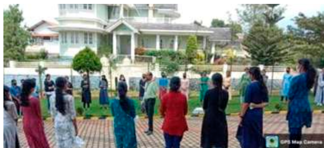
Outbound Training Program