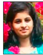
Novia Sunny A Plus CCPA 9.37

To attain additional subject knowledge on General, students were taken to Museum of Geology Department, Govt. College, Nattakom, Kottayam on 30th September 2022. Several talks by eminent physicists were arranged by the department to develop scientific temper in students during the academic year.