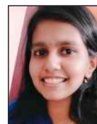
Amala S A Plus CCPA 9.13