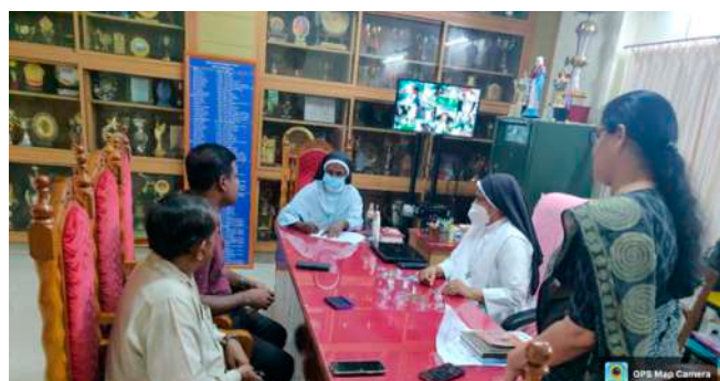
Department of chemistry in association with IQAC signed the agreement with FAITH MISSION on June 28 to the paper waste management.