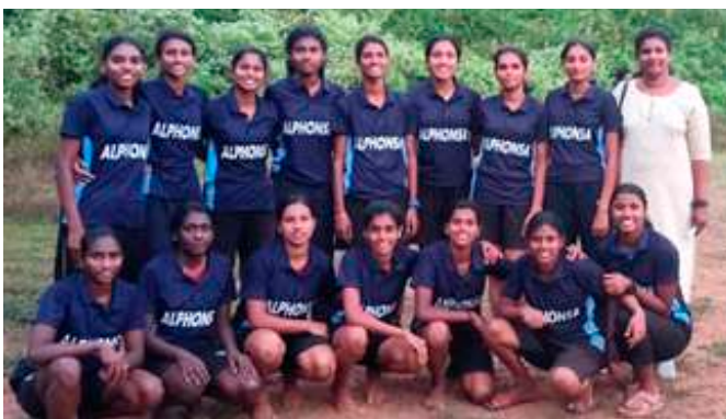
College KhoKho Team