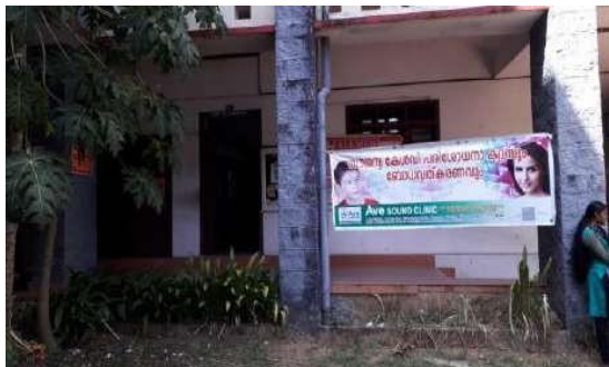
Medical Camp by AllMed

Free eye testing along with free trial of power glasses and contact lenses- both power and cosmetic- was offered.