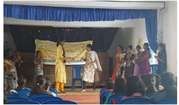
Cultural programmes conducted by theNSS volunteers