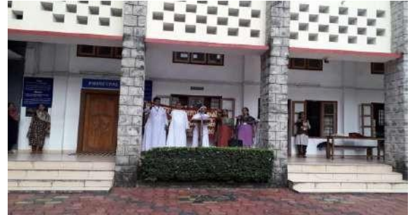
Shuchitva Prathinja (Pledge on Cleanliness)