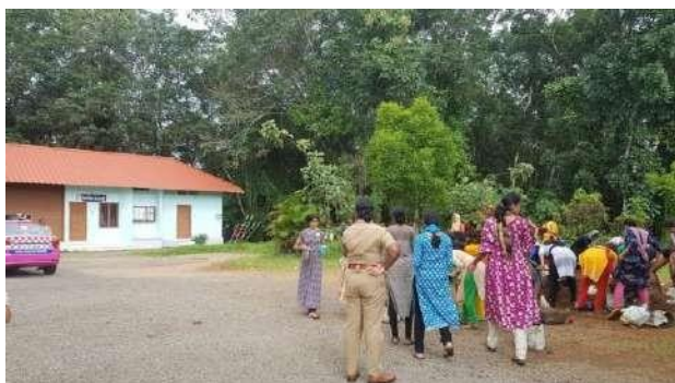
Cleaning area for vegetable garden