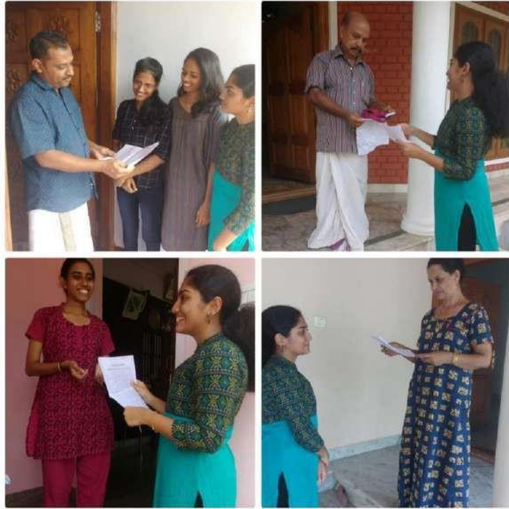
Distribution of leaflets