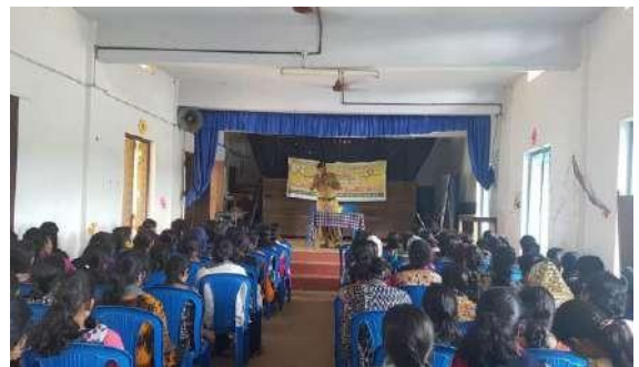
CRO, Janamaithri Police speaking on the topic "SAFETY OF WOMEN"