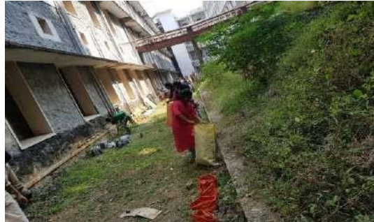
Campus cleaning programmes