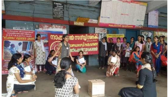
Streetplay at KSRTC bus stand against drugabuse