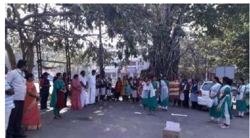
Clean Pala campaign and StreetPlay