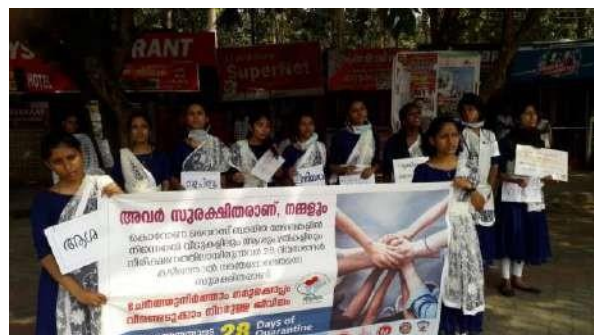
Corona Virus Awareness Programme by Students