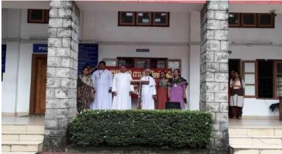
Inauguration of Swachatha campaign by the Principal