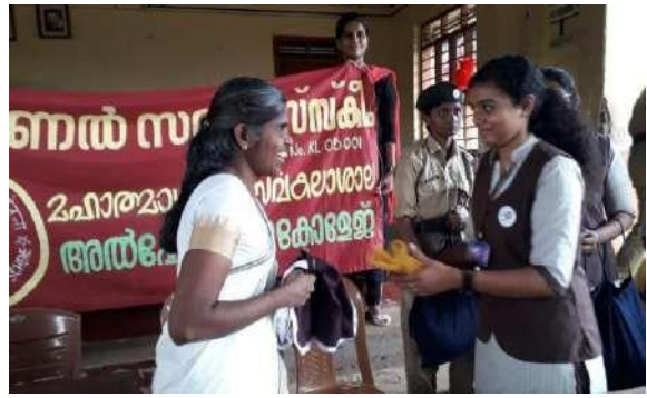
Cloth Bag Distribution