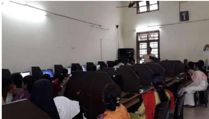
Computer Literacy Class for Office Staff of Alphonsa College