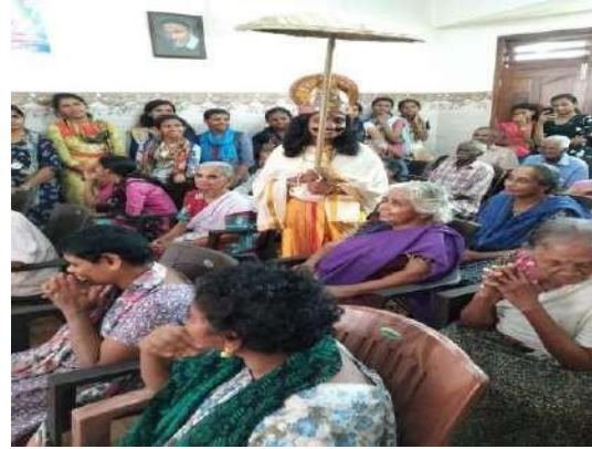
Onam celebration with inmates of old age home.