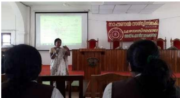
Class on Reproductive Health