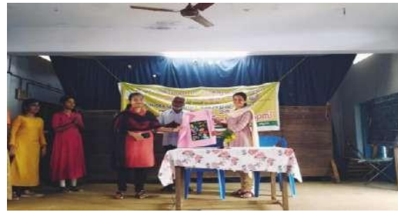
Releasing manuscript magazine "ColourChalk"