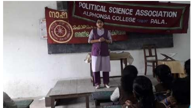
Class Room Lecture