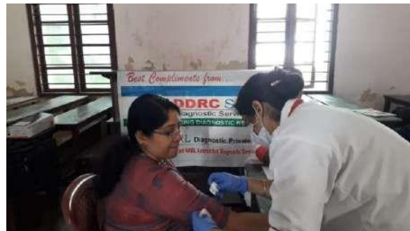
DDRC 17 Test and Medical Camp