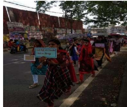
Rally campaigning against drug abuse