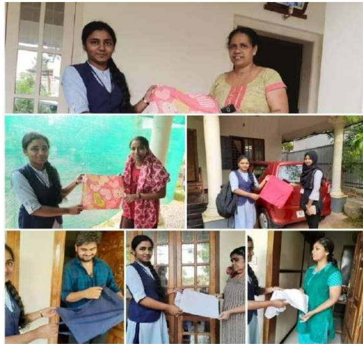
Distribution of cloth bags