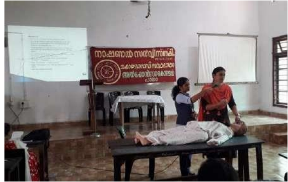
Session on first aid