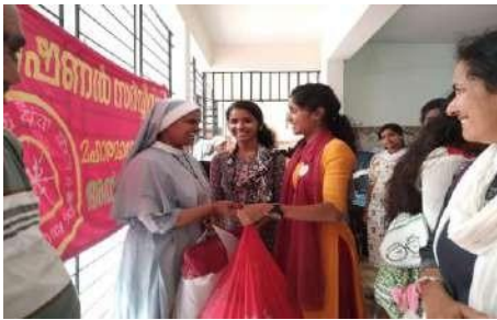
Handing over toilet materials collected by volunteers by