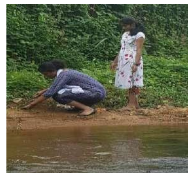
Planting bamboo on river side