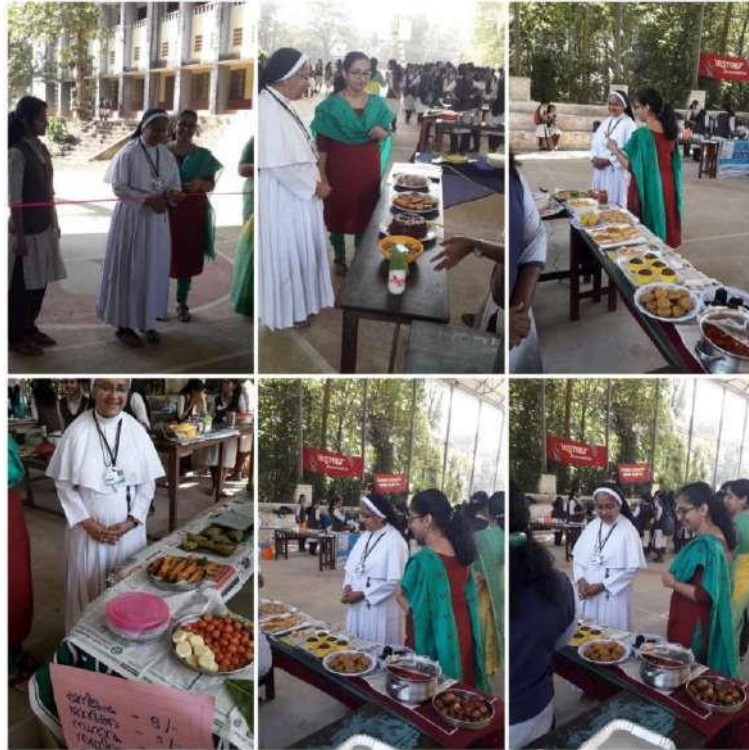
Food Fest CLEANING PROGRAMMES

The unit cooperated with Pala municipality in collecting plastic waste from public places and roads from Kottaramattom private bus stand to Marian Medical Centre, Arunapuram on 25 January 2020. The volunteers also involved in Clean Pala Campaign by performing a street play at Pala town on 25 January 2020.