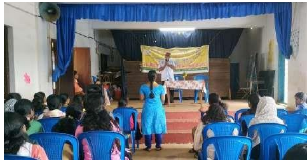
Handing over library books collected volunteers.