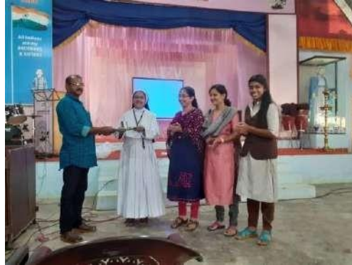
Handing over plates and glasses at Mariasadanam