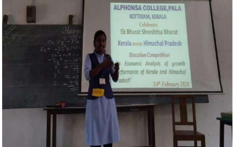
An elocution Competition was organized on 14 February as part of Ek Bharat Svach Bharat Campaign