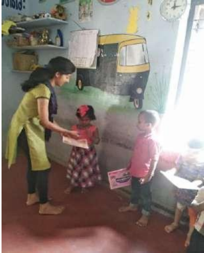
Distribution of study materials at Anganavadi