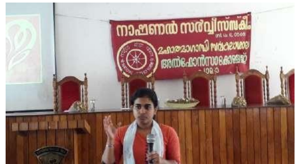
Sessions by Students of Kottayam Medical College