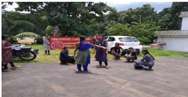
Street play on the topic "Healthy food habits"