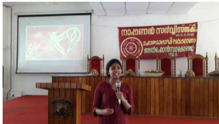
Sessions by Students of Kottayam Medical College