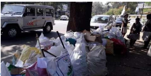
Plastic Waste Collection

The unit cooperated with Pala municipality in collecting plastic waste from public places and roads from Kottaramattom private bus stand to Marian Medical Centre, Arunapuram on 25 January 2020. The volunteers also involved in Clean Pala Campaign by performing a street play at Pala town on 25 January 2020.