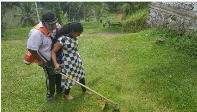
Grass cutting training for