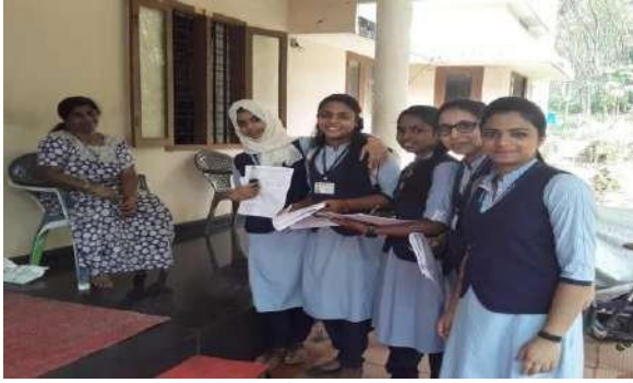
Door to door campaign and distribution of leaflet