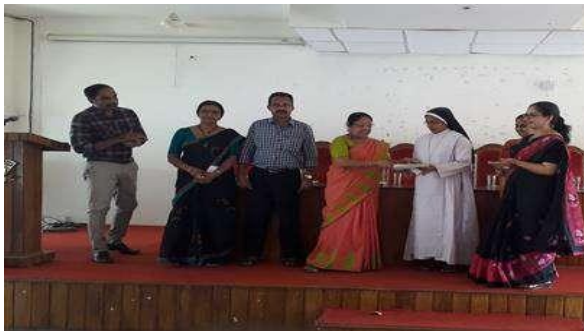
Release of Career Jalakam