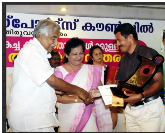
Kerala Sports Council Award 2014