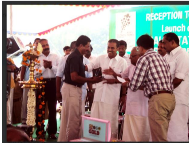
BEST COACH AWARD 2010