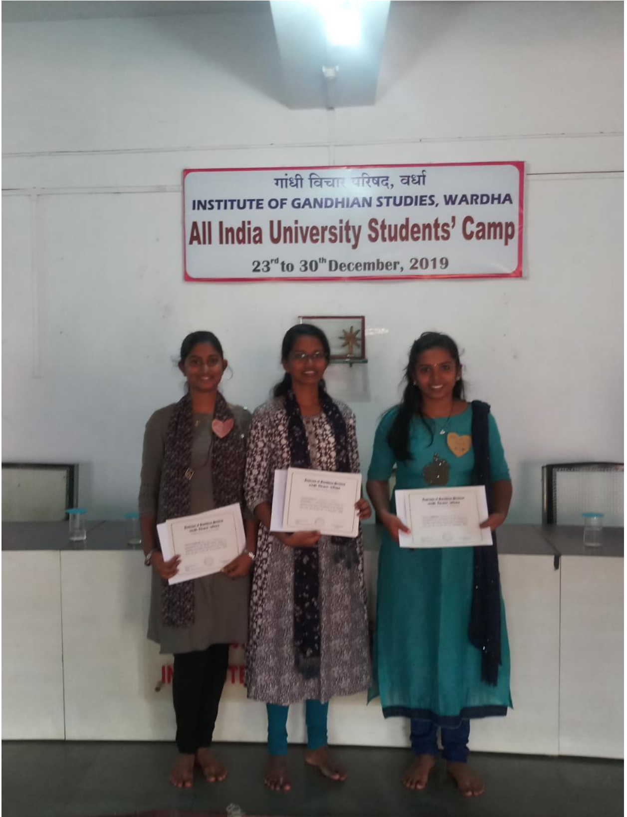
Gandhi Forum members in Wardha, Maharashtra