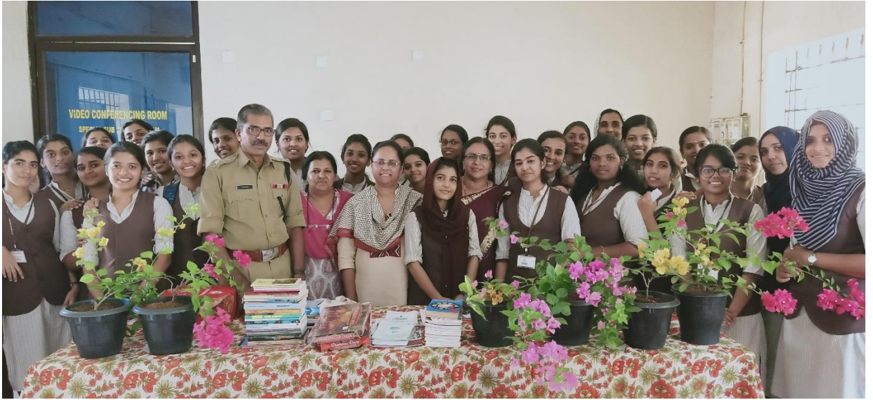
Visit to district Jail, Kottayam