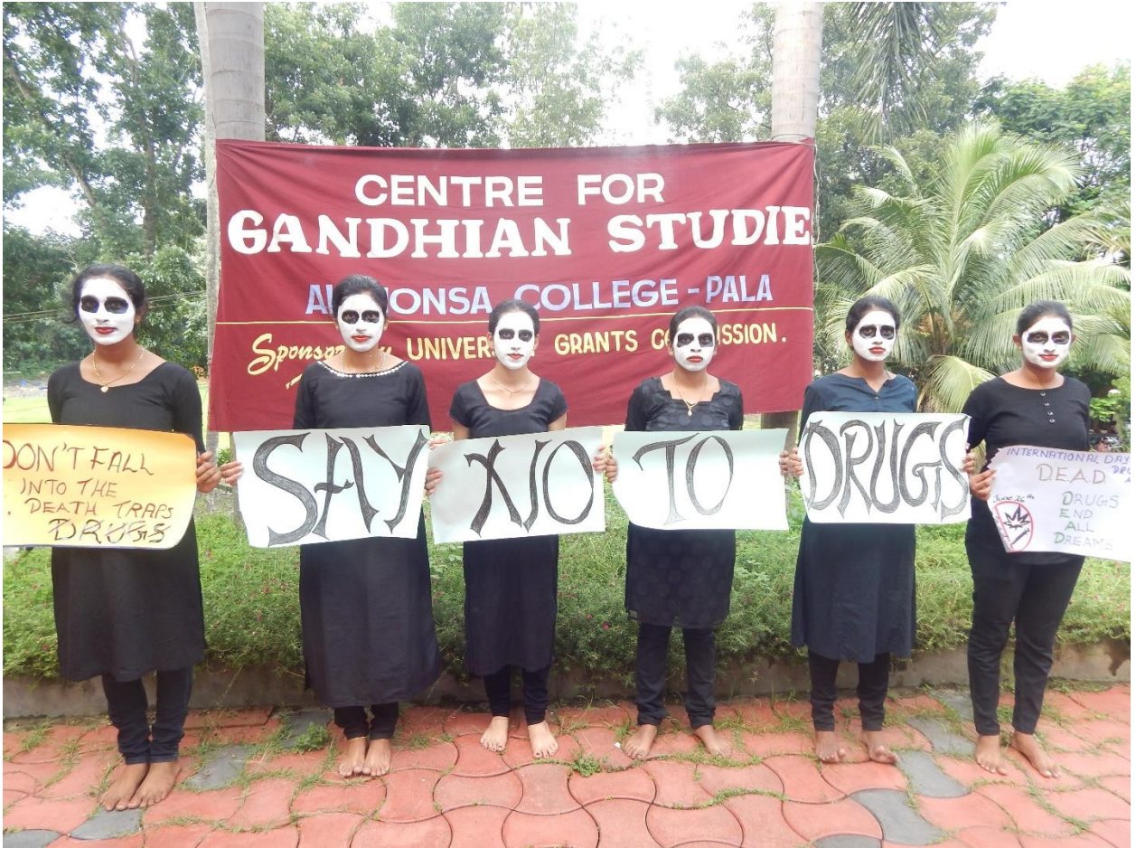
Mime on Drug abuse