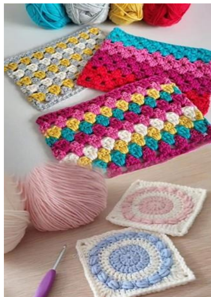
Crochets made in the Workshop