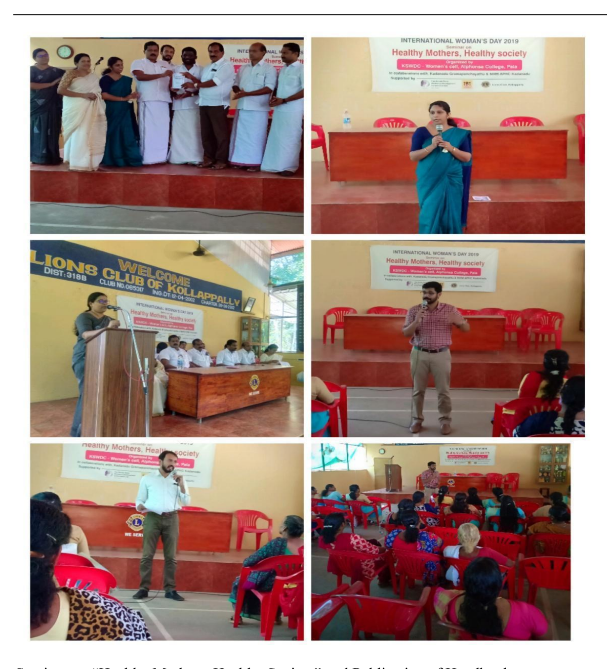
Seminar on "Healthy Mothers, Healthy Society" and Publication of Handbook