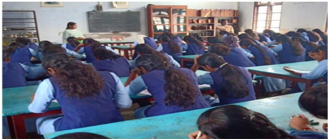
A quiz competition on the topic, "Constitutional and Legal Provisions for Girls and Women".