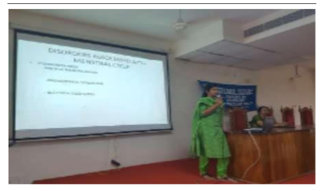
Seminar on "Adolescent Health" on 31 July, 2018.