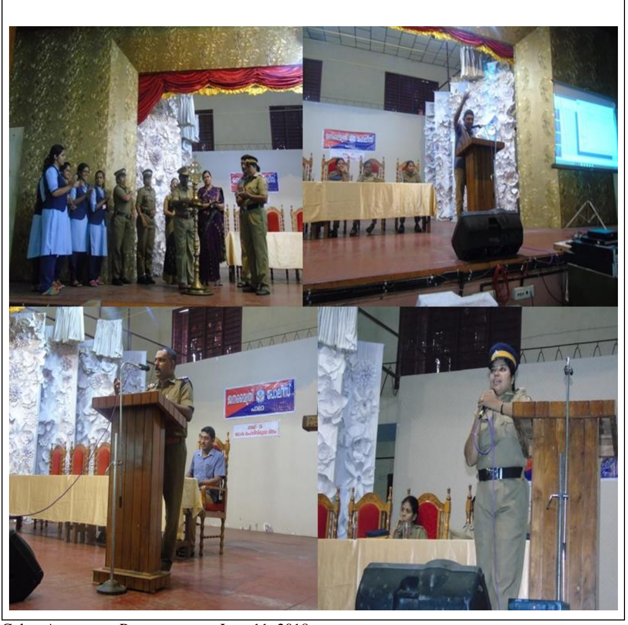
Cyber Awareness Programme on June 11, 2018

in the event of cyber victimization and were informed about available remedies and support systems. The programme included an interactive question-and-answer session where participants had the opportunity to seek clarification on specific concerns related to cyber safety. This facilitated a dynamic exchange of information and enhanced participant engagement.