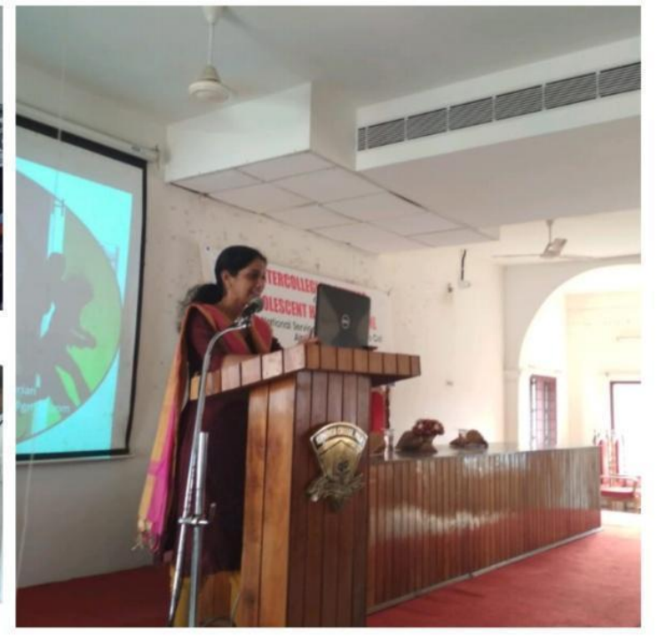
Intercollegiate Seminar on "Adolescent Health and Hygiene"