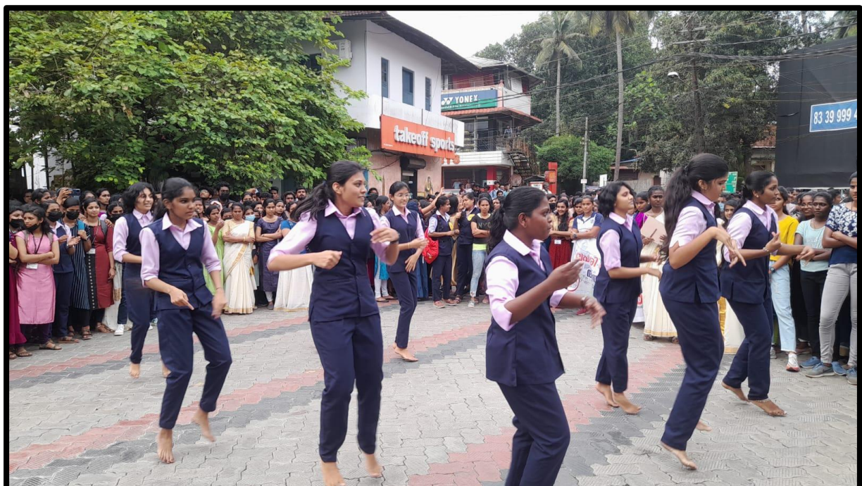
Flash Mob organized as part of anti drug campaign