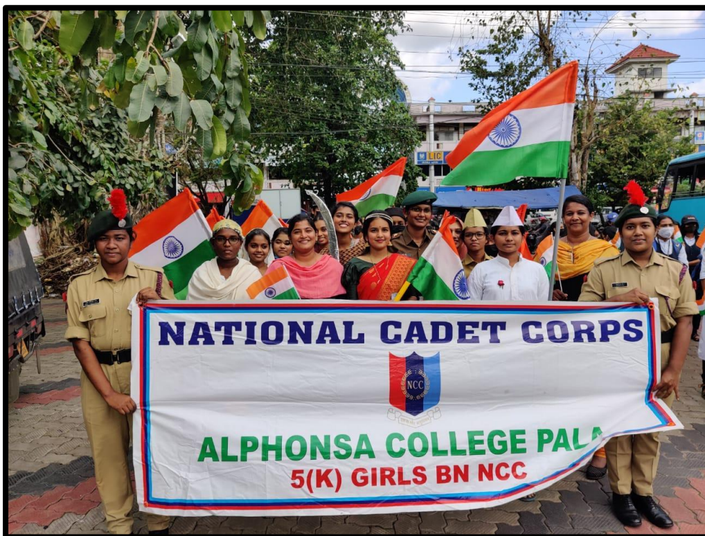
Independence Day Rally