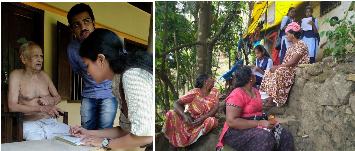
Student volunteers conducting household survey at different villages under UBA

Among the village since the population and areal size was huge, one ward was identified for the UBA activities as discussed in the orientation program conducted by Regional coordinating institute.