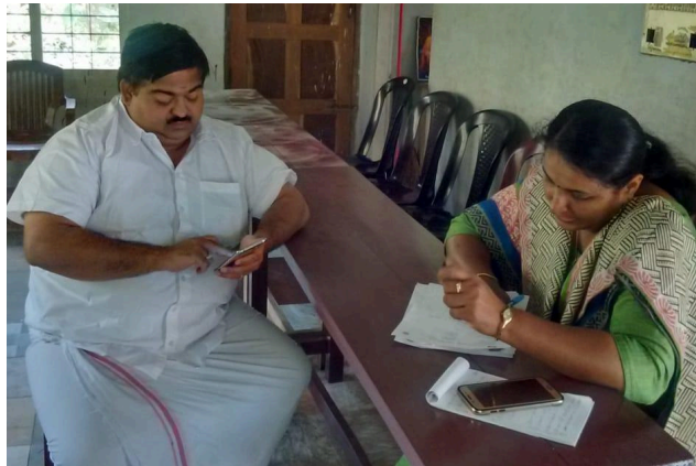
UBA Teacher volunteers discussing with the ward member at Ramapuram and Meenachil Panchayath during village/household survey