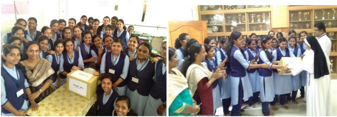
LED bulbs assembled by the UBA volunteers of physics department being given to the college principal for the replacement of all incandescent bulbs of the college campus

As part of energy conservation of the college campus, all incandescent lamps were replaced with student assembled LED bulbs. This was done by the UBA members of the Physics Association of Alphonsa College.