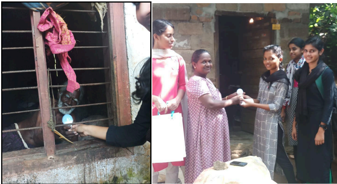
Distribution of Self assembled LED bulbs for free to the villagers by the NSS/UBA student volunteers

LED kits were purchased by the students themselves and were assembled and distributed to village people free of cost to the economically needy.