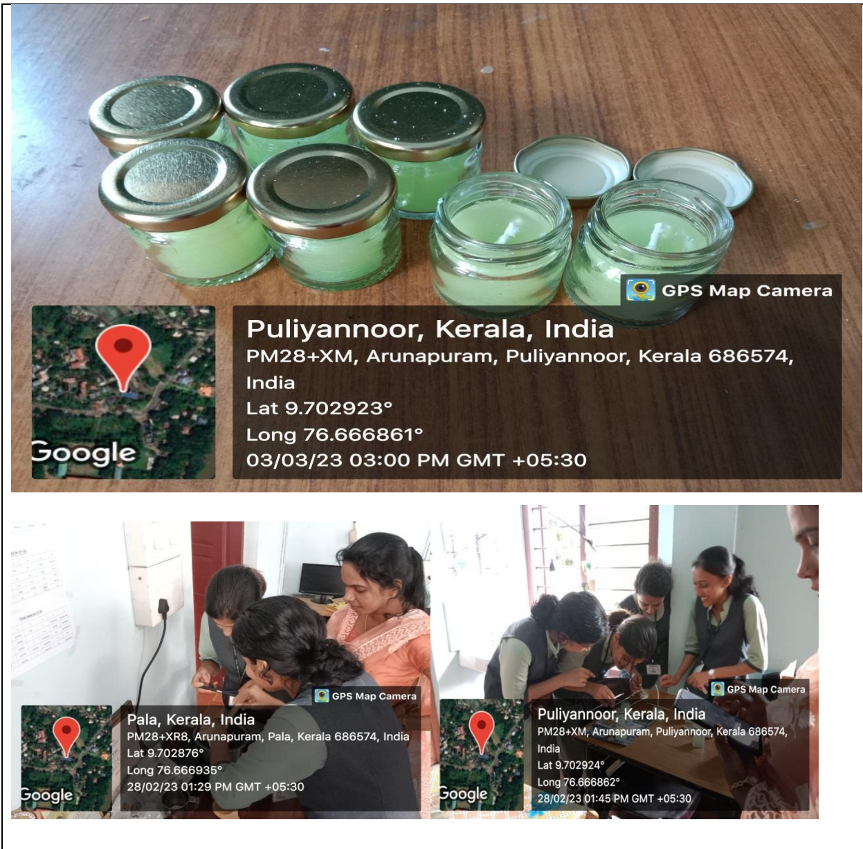
Scented candles by students on 28th February 2023.

The the WEM Club, continued its entrepreneurial journey by launching another set of products under the 'SWESH' brand. On 13th September 2023, they introduced Herbal Bathing Soap and Scented Candle to their product line. This expansion showcased their commitment to innovative ventures and sustainability. The launch event highlighted the unique features and benefits of these new products, emphasizing their herbal and aromatic qualities. The positive