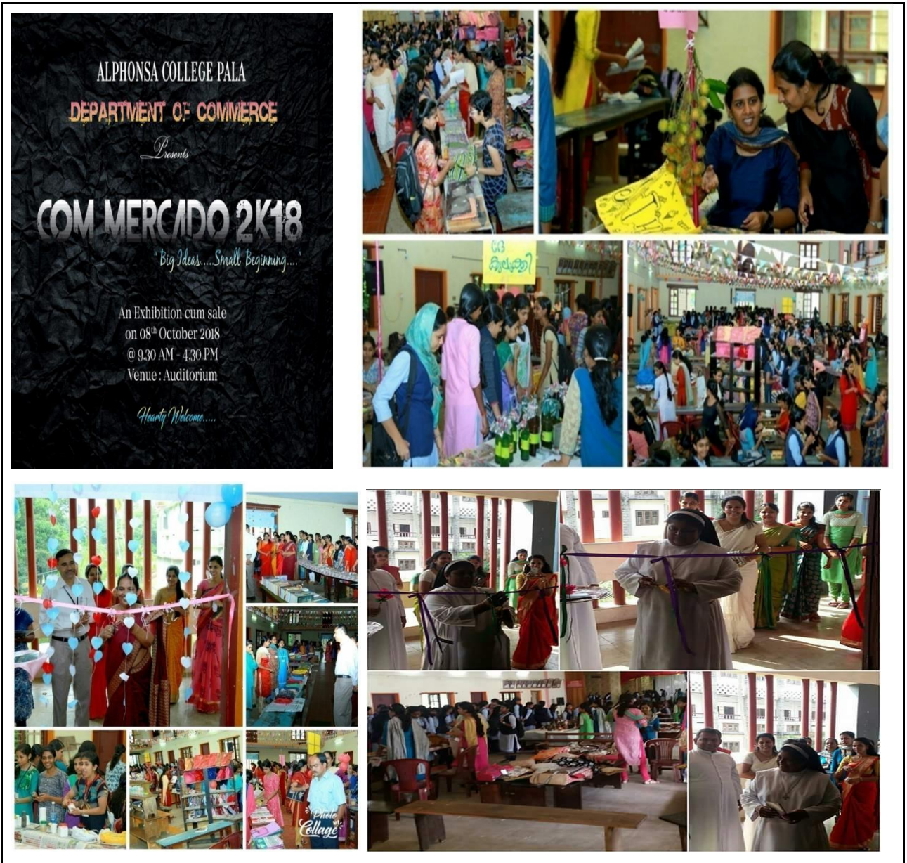
COMERCADO 2K18 on 8th October 2018