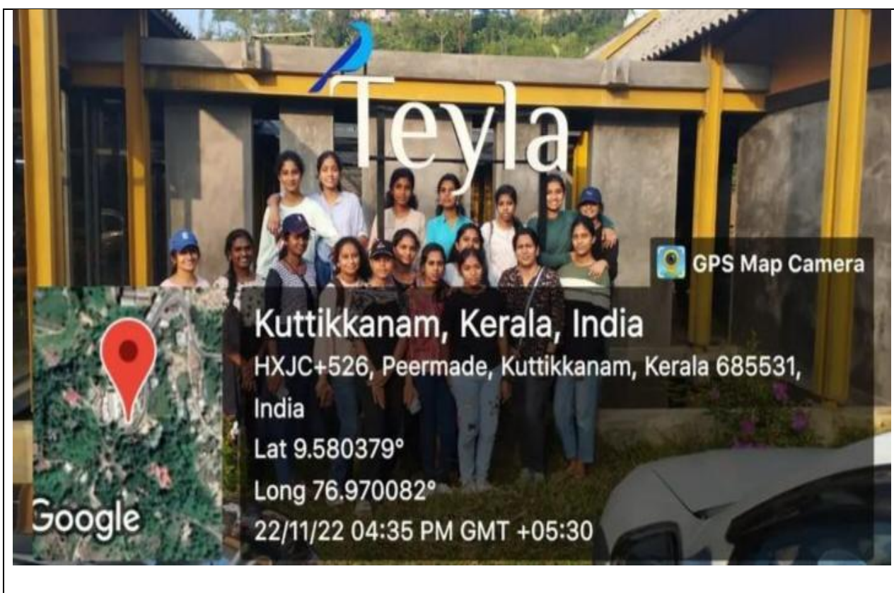
Industrial visit for first-year students to Teyla Kuttikkanam on 22nd November 2022

WEM Club, organized an industrial visit for first-year students to Teyla Kuttikkanam on 22nd November 2022. The visit aimed to provide students with practical insights into industrial operations and entrepreneurship. Students had the opportunity to witness firsthand the workings of an industrial setup, enhancing their understanding of entrepreneurial ventures.