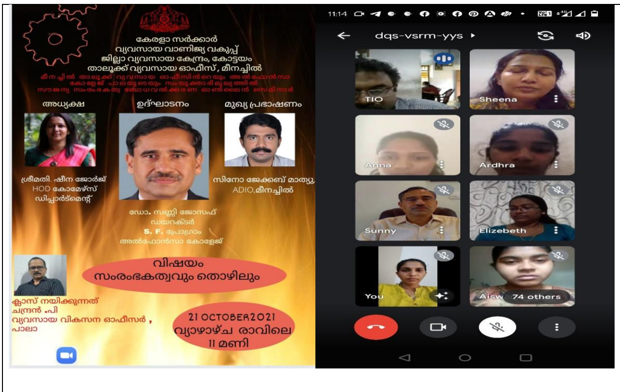
A workshop on "Entrepreneurship as a Profession" on 21st October 2021.