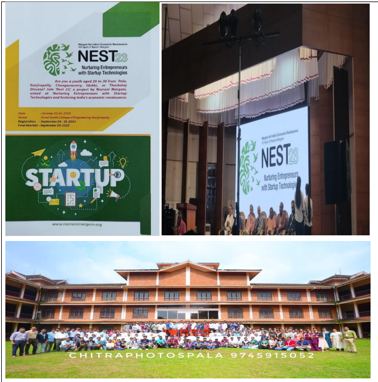
the NEST held at Amal Jyothi College of Engineering Kanjirapally from October 22 to 24 , 2023