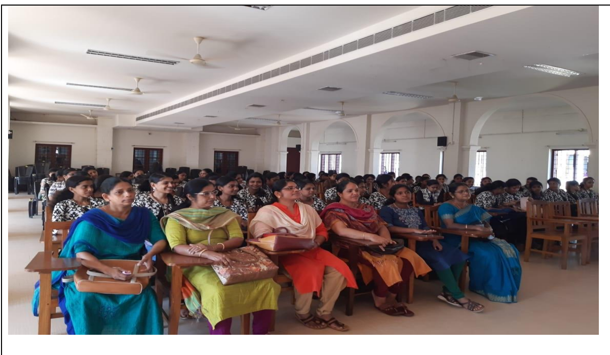
One day workshop on Scope and Marketability of Dairy Products on 27 th November 2019