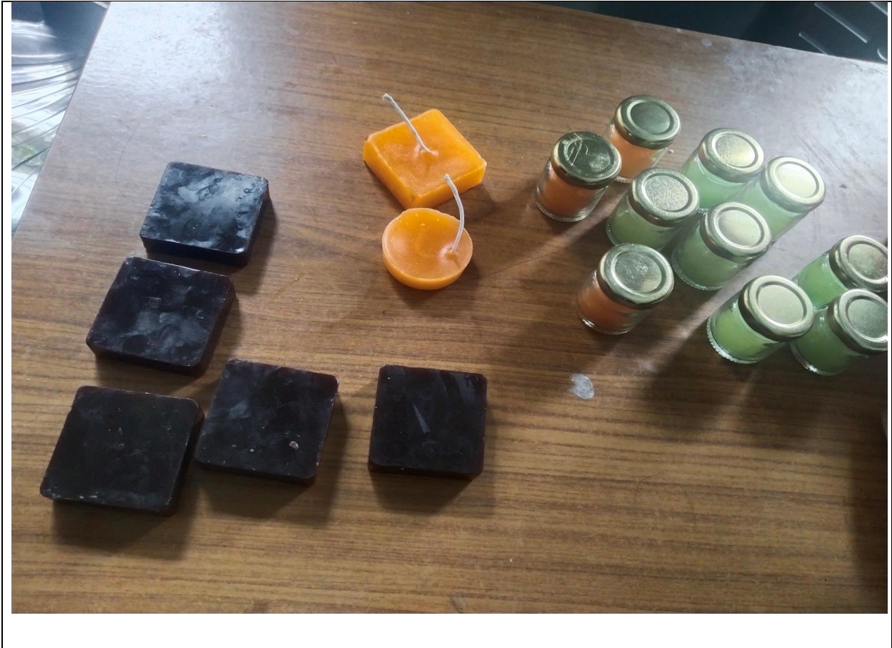
'SWESH' product line - Herbal Bathing Soap & Scented Candle on 13th September 2023

response from the audience further motivated the club to explore more entrepreneurial opportunities, solidifying their role in promoting self-reliance and eco-friendly solutions.