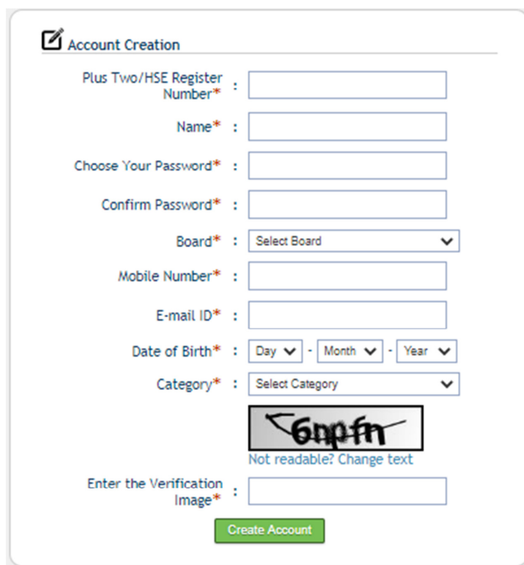
CANDIDATE REGISTRATION SCREEN - 1

Step 1:- Log in www.cap.mgu.ac.in and click on Admission to UG degree Programmes 2021-2022 a form will be shown as given below. Provide all the required fields. There are three categories SC/ST, Others and Lakshadweep Muslims. Make sure that the correct category is selected.