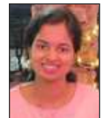
Aryamol S A Plus CCPA 8.84