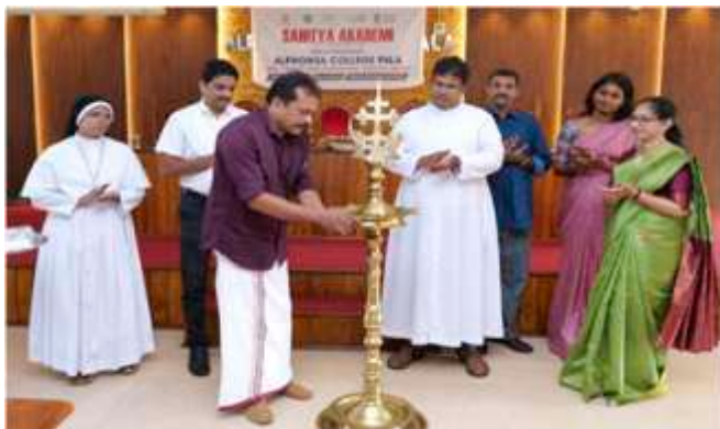
Inauguration of Literary Forum