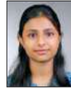
Jissa Baby A Plus CCPA 9.12