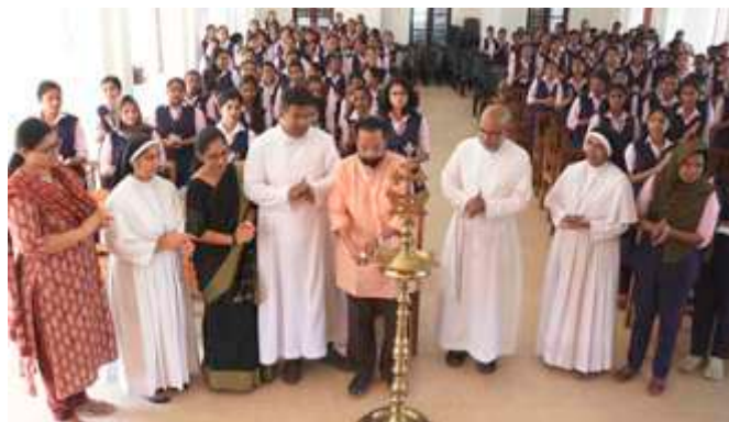
Inauguration of Arnos Padiri Chair.