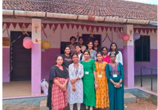
Beautification of booth at Amayanoor