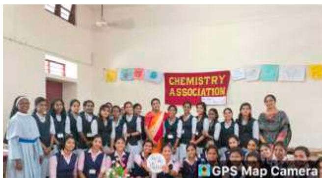
GO GREEN SALE on July 11-12, 2023