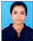
Roslint Sunny A Plus CCPA 9.34