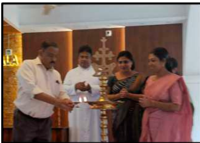
Inauguration of FYUGP Syllabus Revision workshop