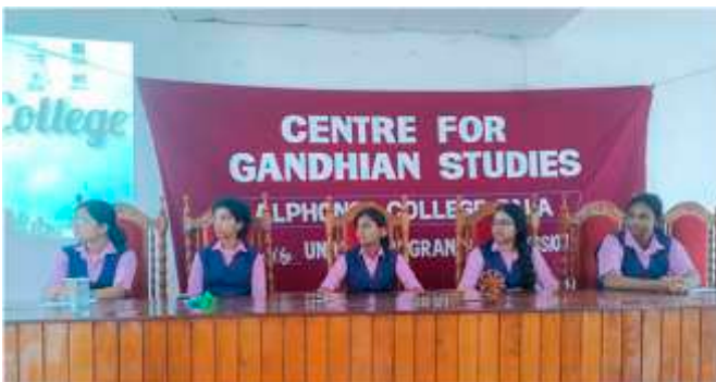
Participants of the Student Conference Lest we Forget: Remembering Hiroshima