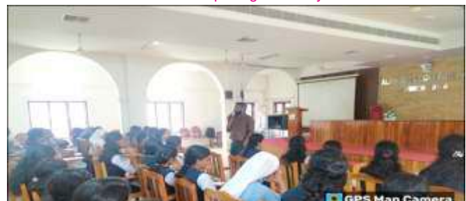
A Session on Competitive Examinations