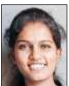
Bhavya M S A Plus CCPA 8.71