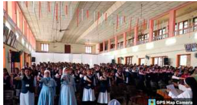
Taking voters pledge on 25th January 2024