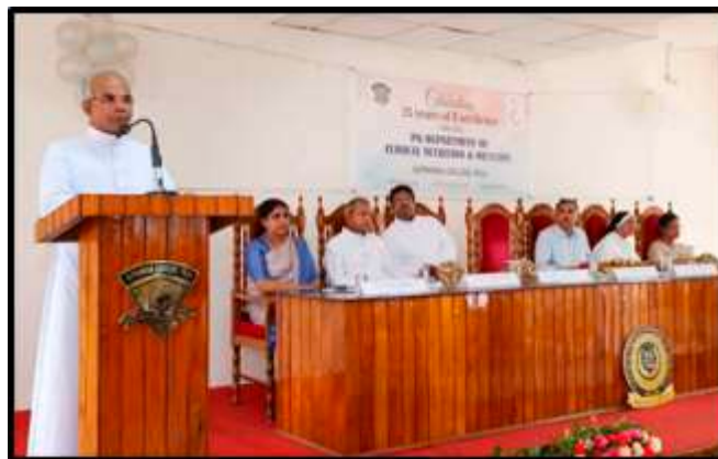
Inauguration of Silver Jubilee Celebrations

November FYUGP syllabus restructuring workshop was conducted. The department also conducted various community extension programmes.