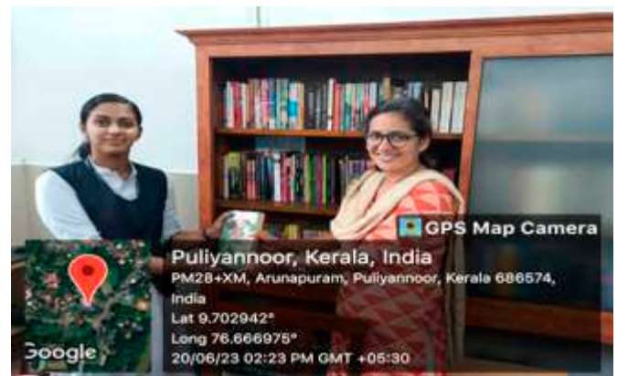
Reading Day Celebrations