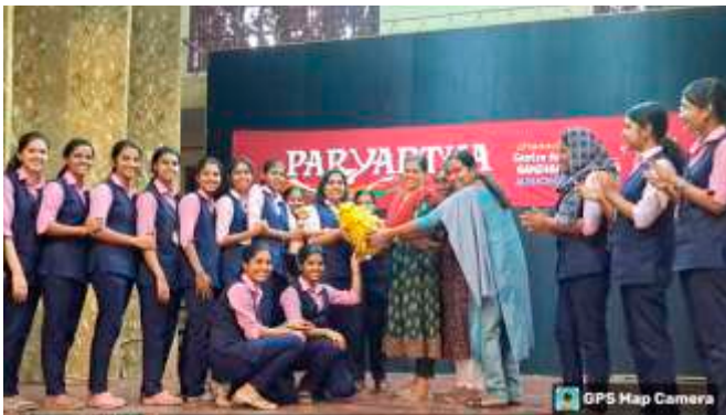
Department of Mathematics won the prize for the Best Department of Paryaptha 2024