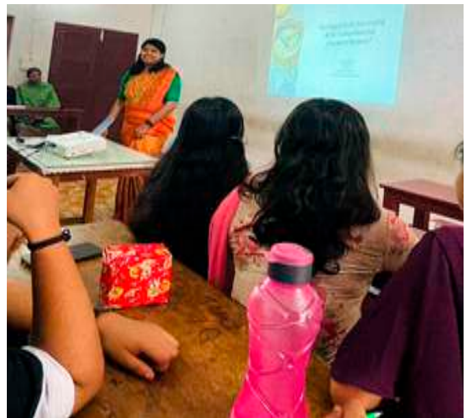
Seminar on The Digital Quill: Harnessing AI for Comprehensive Literature Reviews.

The annual PTA Meeting of the Department was held on 10 February 2024. Apart from the general PTA Meeting, the departmental PTA Meeting was held at 11.30 pm . The Progress reports of the students as well as the PTA Register was signed and the academic progress of the students is discussed during the meeting