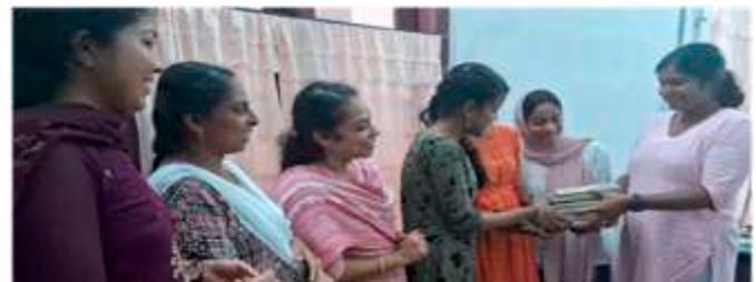
Book Donation in association with UBA, Alphonsa college Pala