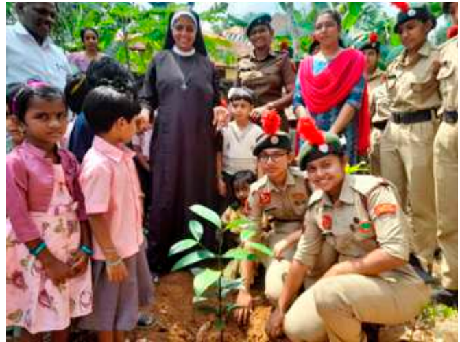
Eden of ACP Fruit Tree Garden project at SHLPS Ramapuram