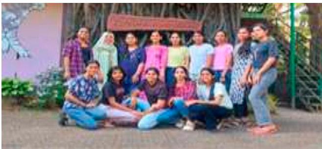
Nature Camp at Periyar Tiger Reserve, Thekkady