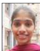
Miliya T Tom A Plus CCPA 9.10