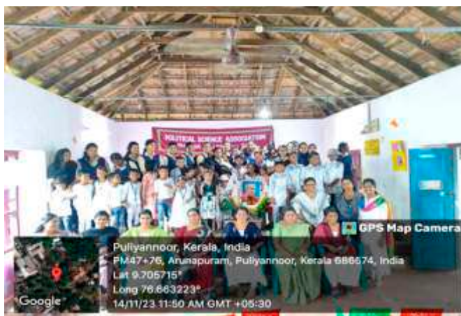
Children's day celebration at Govt. LPS Arunapuram in association with Unnat Bharat Abhiyan