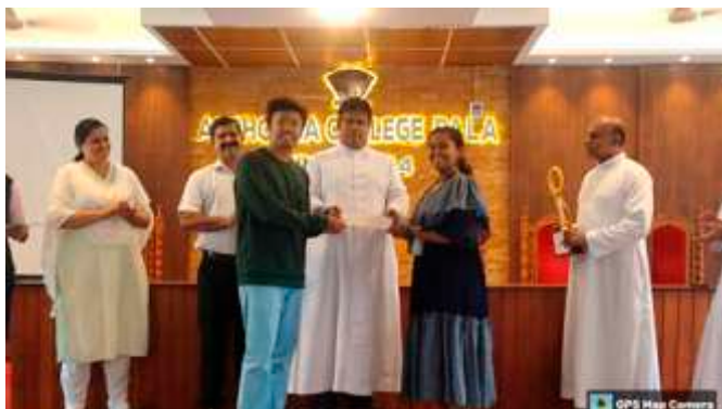
Intercollegiate Quiz competition