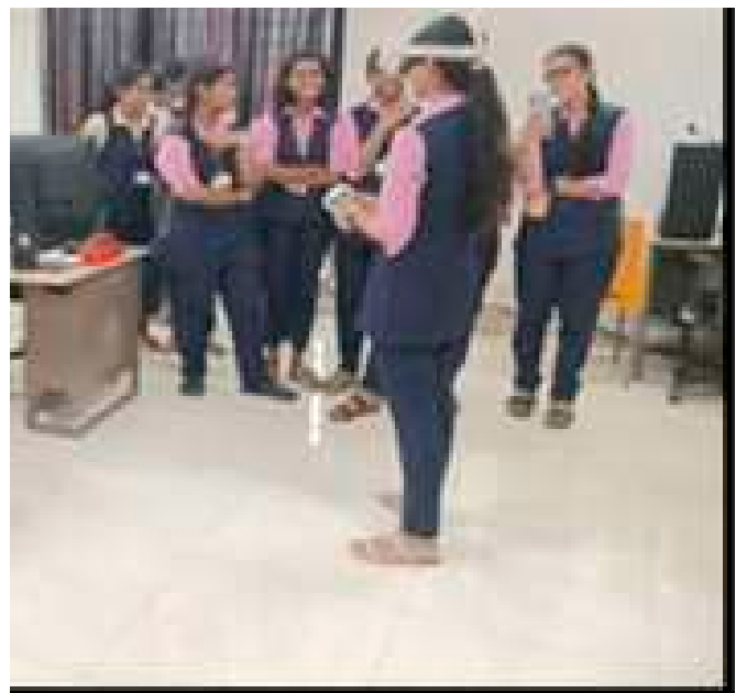
methods and how they can be practically implemented with technology assistance.

IEDC student leads were given an opportunity to visit the Incubation Centre at IIIT Kottayam On 15/03/2024. The visit was really helpful for them to get an outline of the idea incubation