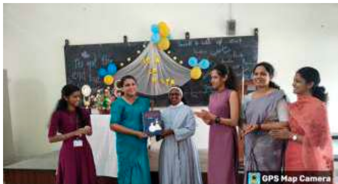
a handwritten magazine 'YOUGIK' made by students of our department was released on march 5th, 2023.