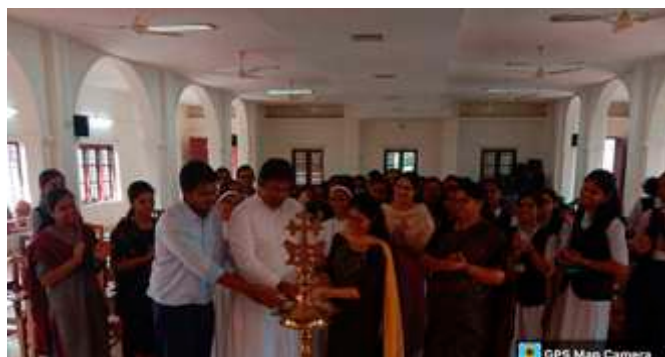
Workshop on Game Theory and Python Programming