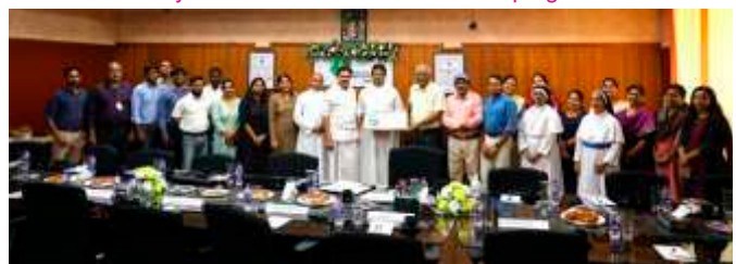
MoU signing between Alphonsa College and IIITK