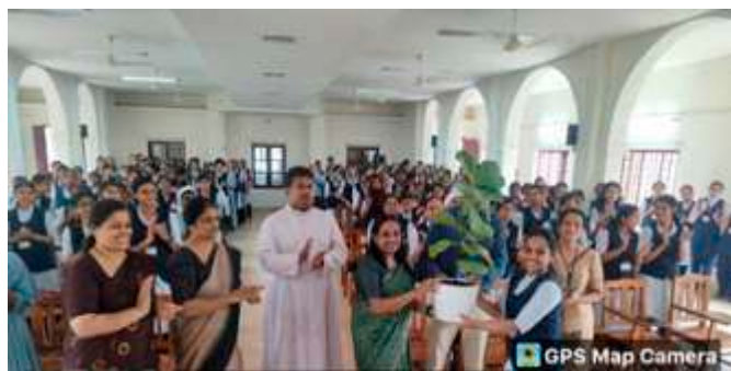
ALPHAGREEN 2023 World environment day celebration on June 6th 2023