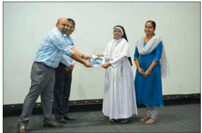
The college receives Membership in Academic Membership Programme by ICT Kerala

Career and Placement Cell of the college plays a pivotal role in supporting the career aspirations of the students by providing them proper orientation regarding their prospective career options, giving them training in various skills so as to make them employable and conducting recruitments which are beneficial to the students. This year, the Cell conducted various activities to foster the capacity and capability of the students including orientation sessions, webinars, upskilling programmes, workshops, registration drives, and coaching sessions on PSC, UPSC and other competitive examination and placement drives. The major focus was on the students of the final year batches of degree and PG. The college got membership in the Academic Membership program by ICT Kerala last year. The students were given the opportunity to participate in several programmes connected to it. Thus the year was fruitful in improving the quality of the student community as a whole.