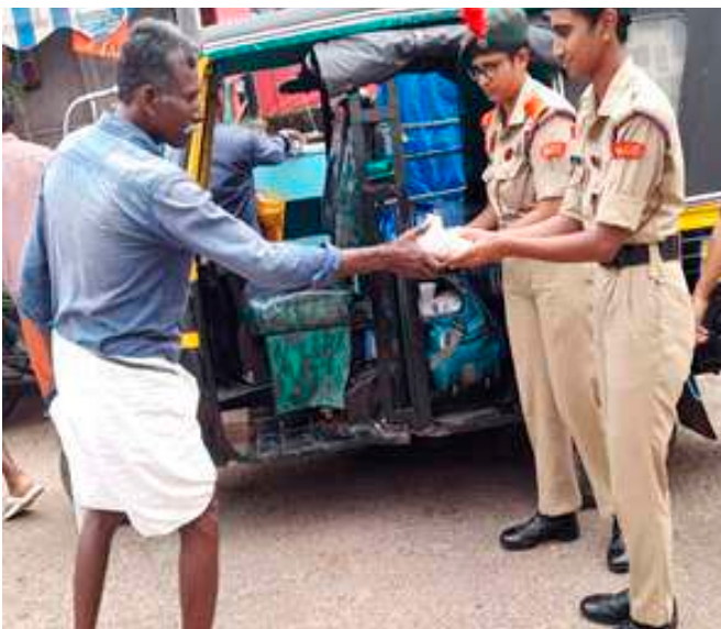
Food Packet Distribution

Received Special Appreciation from Pala Municipal Council for the social service initiatives undertaken by the sub unit.