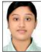
Jincil Saji A Plus CCPA 8.51