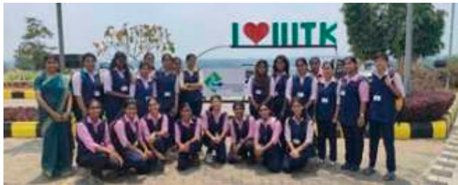
Students with faculty in IIIT K

Quality circle students accompanied faculty members visited the Indian Institute of Information Technology, Valavoor, Kottayam on 15th March 2024. The team visited the Gyaan Innovation lab and interacted with the technical experts.