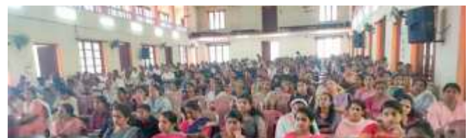
Annual General Body Meeting

The new office bearers extended all support and cooperation to the college in all its endeavours, ensuring their active presence whenever required.