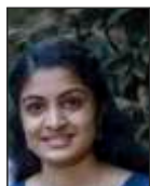
Jiffy Biju A Plus CCPA 8.51