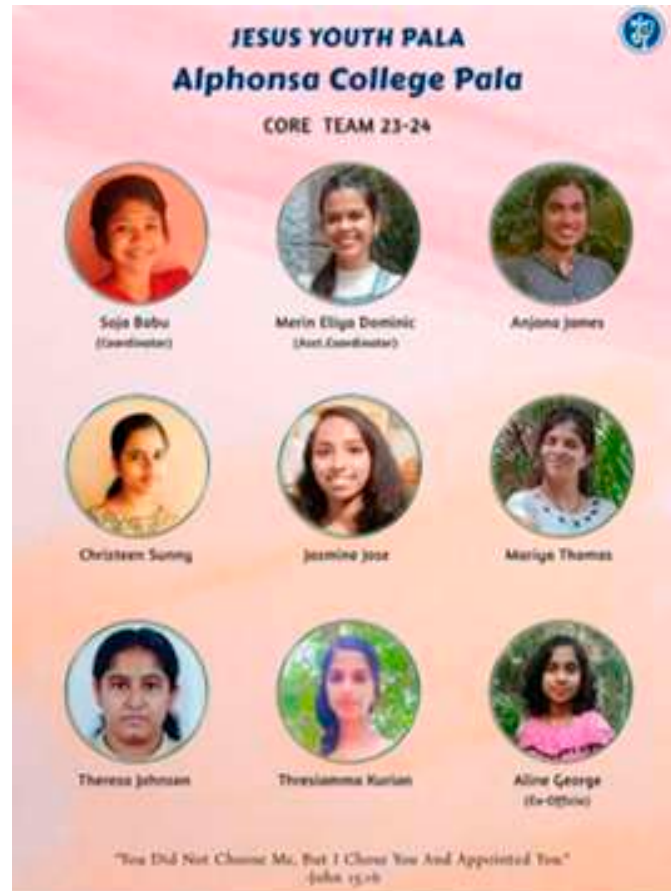
Core Team 2023-2024

lOve of GOd. There were participants and vOLunteers frOm AlphOnsa COLlege. Campus leaders training prOgramme was cONducted at Chavara CMI public schOOL frOm 7th to 10 th March 2024. There were participants and vOLunteers frOm Our cOLlege.