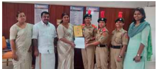
Special Appreciation from Pala Municipal Council for the social service initiatives undertaken by the sub unit