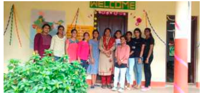
Booth beautification at Thiruvanchoor