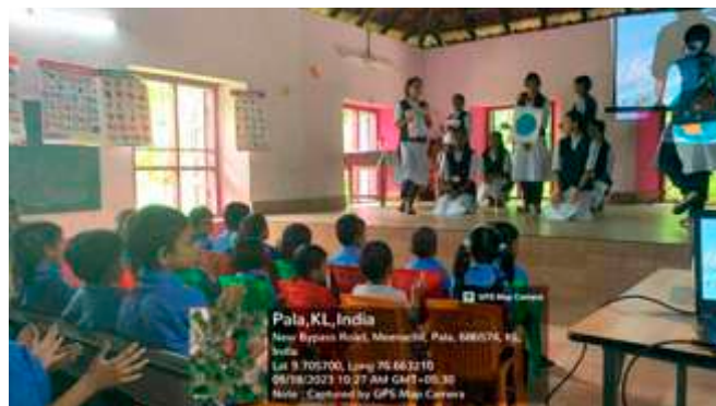
Awareness program and painting competition on Ozone day at Government LP school, Arunapuram on 18th September 2023