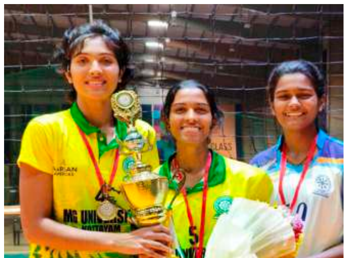
Winners of all India Inter university Volleyball Championship held at Kalinga Institute of Social Science University, Bhubaneswar- 11 to 14 January 2024