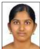
Bileena PG A Plus CCPA 8.88